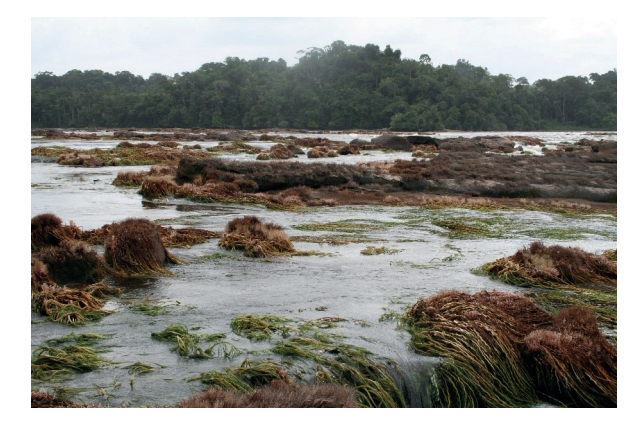
Figure 1. Carrao River, Orinoco River Basin, Venezuela with Podostemaceae beds.

The urgency to understand global biodiversity has become heightened with recent reports of a 68% decline in wildlife populations between 1970 and 2016 (Almond et al. 2020). Rivers are at an especially high risk of ecosystem change with global increases in dam construction (Dethier et al. 2022). Our study sought to further document lotic arthropod biodiversity by exploring associations with Podostemaceae in Central and South America from 12 Podostemaceae species, 10 of which had never been evaluated for arthropod diversity. We chose samples collected from northern Costa Rica to southern Brazil, expanding the geographic range of known arthropod associations with Podostemaceae in Central and South America.