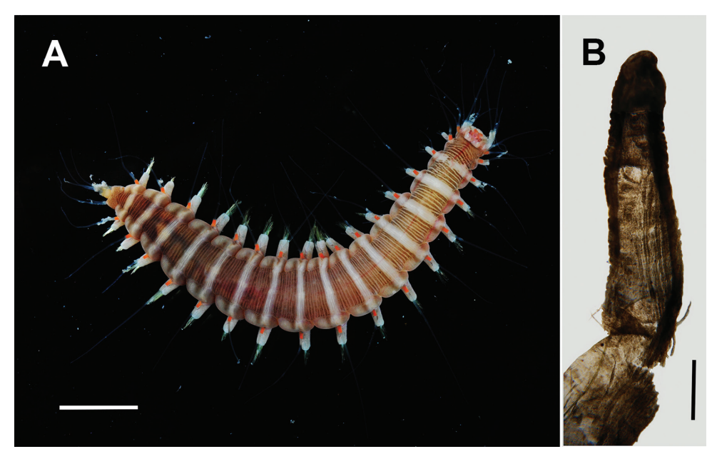
Figure 1. Specimen of Hesione picta Müller containing the copepod Monocheres sergioi sp.n. from off Long Key, Florida. A habitus, dorsal view B dissected digestive caecum. Scale bars: A = 5 mm, B = 1 mm.

Antenna (Fig. 2D) with slender, elongate basis carrying short, 1-segmented exopod and long, well-developed endopod. EXP longer than wide, armed with one long seta. ENP1 slightly shorter than basis. ENP2 armed with 1 seta, ENP3 longer than second, armed with short seta and stout, slightly curved terminal claw.