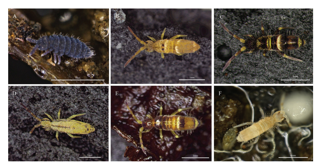
Figure 1. Photos of Collembola in Taiwan A Ceratophysella communis (Folsom, 1898) B Homidia linhaiensis Shi, Pan & Qi, 2009 C Homidia nigrocephala Uchida, 1943 D Homidia socia Denis, 1929 E Homidia taibaiensis Yuan & Pan, 2013 F Sinella curviseta Brook, 1882.

diverse arboreal composition (Lee and Park 1989). Collected in Xiayun, Taoyuan City (24°49'40.9"N, 121°22'50.3"E) on 4 November 2020.