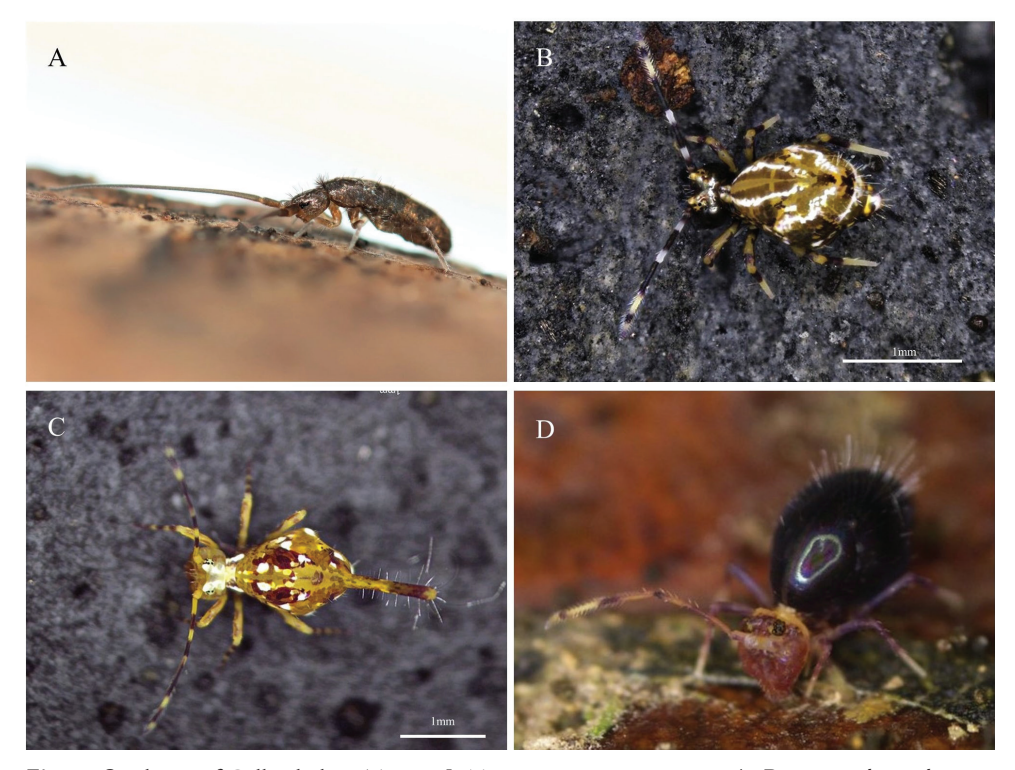
Figure 3. Photos of Collembola in Taiwan A Tomocerus ocreatus Denis, 1948 B Papirioides caishijiensis (Wu & Chen, 1996) C Papirioides jacobsoni Folsom, 1924 (spotty morph) D Ptenothrix corynophora Börner, 1909.

and a "milky" morph with irregular white patterns that are connected throughout the body (Fig. 5). DNA barcodes showed that the P. jacobsoni specimens analysed contain two genetically-distinct lineages, L1 and L2 (Fig. 5), corresponding to specimens collected in northern and central Taiwan, respectively. The mean p -distance between L1 and L2 is 8.3% (range: 7.6–8.8%). The "spotty" and "milky" colour-morphs can be found in both L1 and L2 and, thus, are not genetically distinct from each other. In fact, at one location, we found both the "spotty" and the "milky" morphs with identical COI sequences (NTUM-COL-00005 and 00006; Fig. 5).