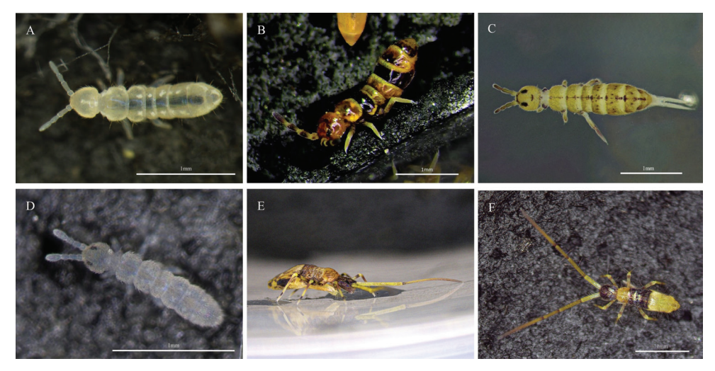
Figure 2. Photos of Collembola in Taiwan A Folsomia candida Willem, 1902 B Isotoma pinnata Börner, 1909 C Isotomurus punctiferus Yosii, 1963 D Proisotoma minuta (Tullberg, 1871) E Callyntrura taiwanica Yosii, 1965 (lateral view) F Callyntrura taiwanica Yosii, 1965 (dorsal view).

Remarks. Yosii (1963). Locality unknown.