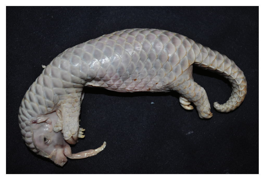
Figure 3. The newborn Chinese pangolin baby MP86 (by Fuhua Zhang, 19 Oct 2011).