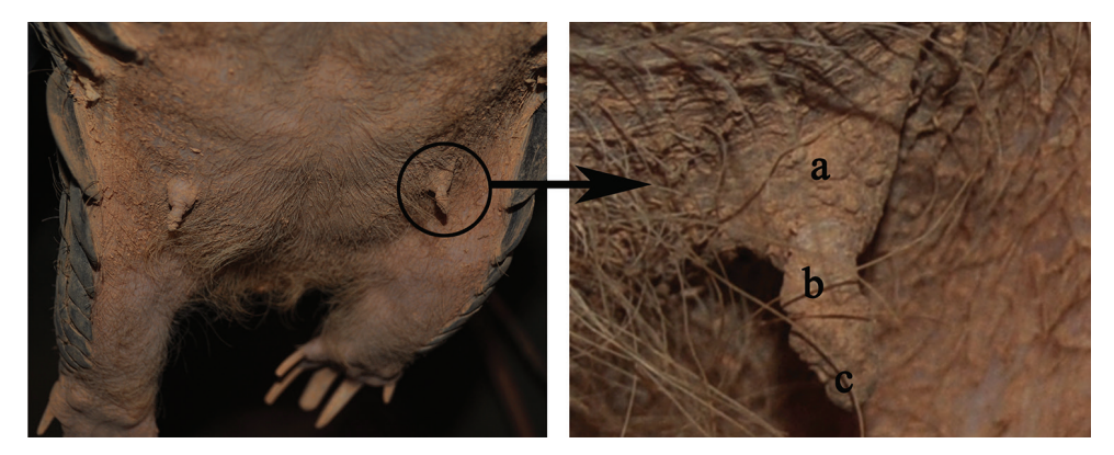
Figure 1. Breast and waxy secretion covering the nipple surface of the female pangolin MP8 for the parturition the day before (by Fuhua Zhang, 18 Oct 2011). a breast b nipple c waxy secretion covering the nipple surface.