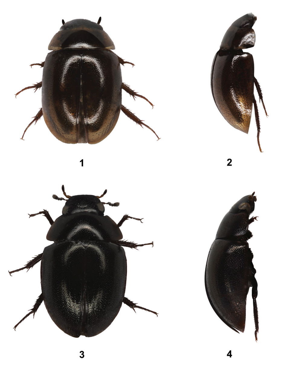
Figure 1–4. Habitus of new Anacaena species 1, 2 Anacaena angatbuhay sp. nov. 3, 4 Anacaena auxilium sp. nov. in (1, 3) dorsal and (2, 4) lateral views. Scale bar: 1 mm.

diameter of eye. Pronotal punctures large, sparse, deeply impressed on the disc, shallowly impressed laterad; interstices as wide as diameter of 2–5 punctures. Anterior margin curving slightly inwards on both sides behind the eye, gradually curving outwards starting from lateral 0.15–0.2 on both ends. Lateral margins almost straight, with setae more numerous in the anterior portion. Postero-lateral angles slightly rounded, ca. 80–85°. Posterior margin thickly bordered, almost straight. Prosternum flat. EL/