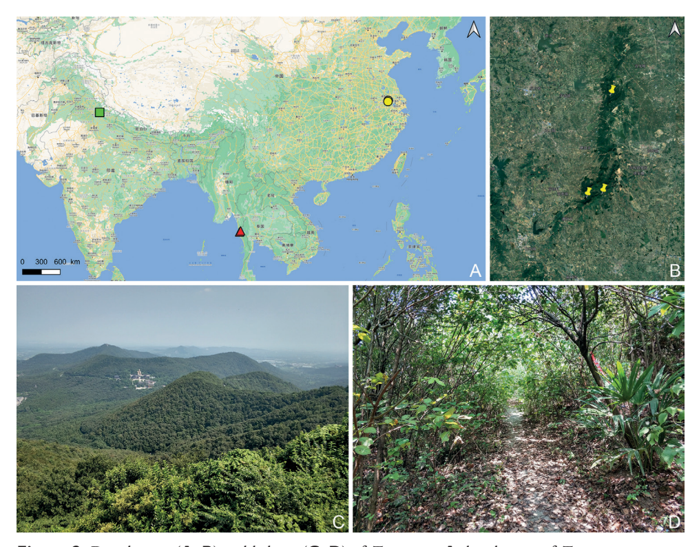
Figure 2. Distribution ( A , B ) and habitat ( C , D ) of Trisiniotus . A distribution of T. taoismus sp. nov. (circle), T. nitidulus (triangle), and T. nodicornis (square) B distribution of T. taoismus sp. nov. in the Maoshan mountains C environment of Maoshan D habitat of T. taoismus sp. nov.

Pronotum (Fig. 1B) approximately as long as broad, length 0.45–0.46 mm, width 0.46–0.47 mm, widest at middle; sides rounded; disc slightly convex, finely punctate, median longitudinal sulcus absent, semi-circular lateral sulci extending from dorsal surface laterally and posteriorly and then fused with lateral ends of antebasal sulcus; lacking median antebasal fovea, with short mediobasal impression, antebasal tubercles small, lateral antebasal foveae connected by transverse antebasal sulcus; outer and inner pairs of basolateral foveae distinct. Prosternum with anterior part as long as coxal part, with small lateral procoxal foveae; hypomeral ridge short, present only at base, with a lateral antebasal hypomeral impression; margin of coxal cavity weakly carinate.