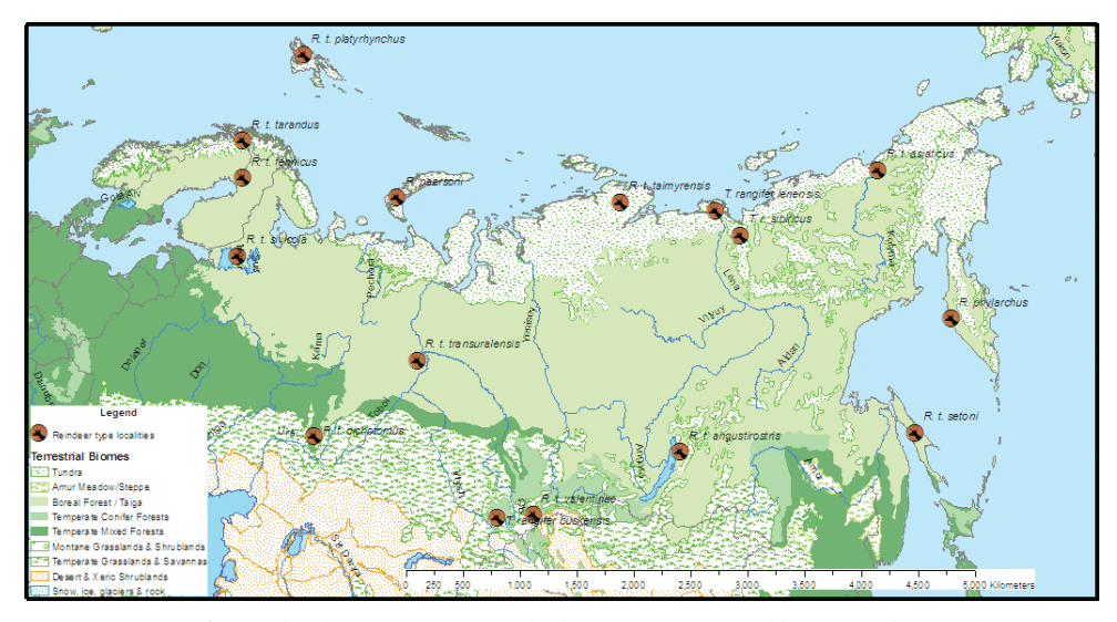
Figure 3. Rangifer type localities in Eurasia overlaid on WWF terrestrial biomes (Olson et al. 2001).

Rangifer t. sibiricus includes 19 herds, named for their calving grounds, from Arkhangelsk in European Russia to Chukotka, Siberia (Mizin 2018; Rozhkov et al. 2020). Although domestic reindeer descended from tundra types, there is a "clear genetic differentiation between domestic and wild reindeer populations" with ~ 6% introgression by wild reindeer into domestic clades and none the other way (Kharzinova et al. 2018; Rozhkov et al. 2020). There is little genetic difference among wild tundra populations of R. t. sibiricus in Taymyr, northern Yakutia, and Chukotka (Kharzinova et al. 2018).