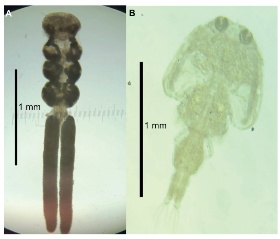
Figure 3. Parasitic copepods on Lagocephalus laevigatus from the Campeche coast, Gulf of Mexico. A Taeniacanthus lagocephali B Caligus haemulonis