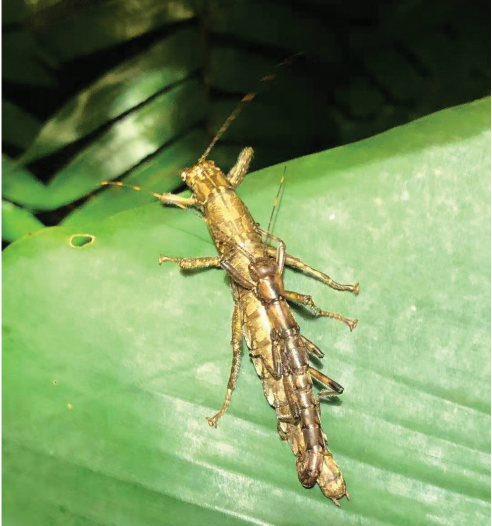
Figure 5. Dajaca napolovi , female and male mating in the wild (from Jianfengling National Forest Park in Hainan Province, China)

profemora 7.0–8.0; mesofemora 6.0–7.0; metafemora 9.0–10.0; protibiae 5.5–6.0; mesotibiae 5.0–5.5; metatibiae 8.5–9.0. Female. Body length 58–61; head length 5.7–6.0; pronotum length 7.5–8.0; mesonotum 8.0–9.0; metanotum 2.6–3.0; median segment 4.5–5.0; profemora 7.5–9.0; mesofemora 7.0–8.0; metafemora 11.0–12.0; protibiae 6.5–7.0; mesotibiae 6.0–6.5; metatibiae 9.5–10.0. Egg. Width 1.2–1.3; height 2.4–2.6; length 3.0–3.3.