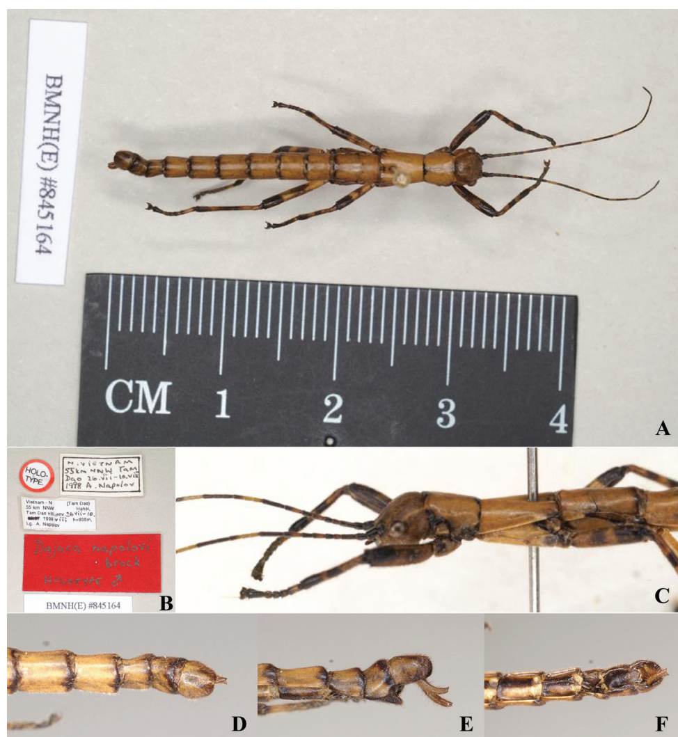
Figure 2. Dajaca napolovi , male, holotype (from Phasmida Species File 2021, photos by Paul Brock; published under CC BC -ShareAlike 4.0 International License). A habitus, dorsal view B data labels C head, lateral view D terminalia, dorsal view E terminalia, lateral view F terminalia, ventral view.

humped. Antennae filiform, longer than forelegs, with yellow bands; scapus rectangular and flattened, longer than pedicellus, pedicellus cylindrical and slightly wider than third segment. Eyes rounded, colored yellow with a black median line, occupying 1/2 of gena (Figs 3B, C, 4A, C). Thorax. Smooth and unarmed. Pronotum somewhat square, length almost as long as broad. Mesonotum anteriorly slightly narrowed and gradually broadening posteriorly, ca 1.5× as long as pronotum. Metanotum wider than long. Median segment slightly wider than long, 2× length of metanotum (Figs 3A, 4A, C). Abdomen. Cylindrical, smooth, and lacking armature. Terga II–VII