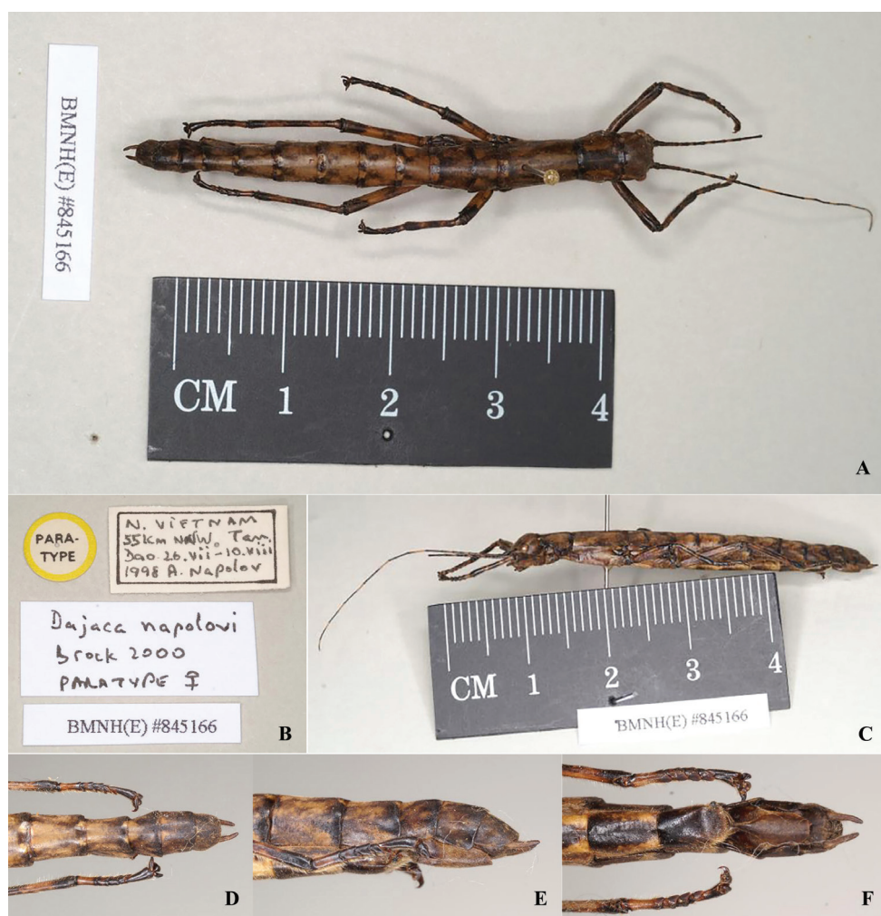
Figure 4. Dajaca napolovi , female, paratype (from Phasmida Species File 2021, photos by Paul Brock, published under CC BY-ShareAlike 4.0 International License). A habitus, dorsal view B data labels C habitus, lateral view D terminalia, dorsal view E terminalia, lateral view F terminalia, ventral view.

(Fig. 3A, D–F, 4A, C, D–F). Legs. Brown with irregular black stripes, all femora laterally compressed, more or less triangular, lacking dorsal carinae, ventral carinae distinct (Figs 3A, 4A, C).