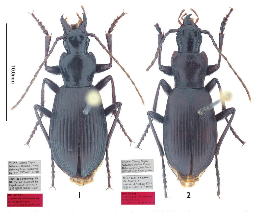
Figures 1, 2. Holotypes of Laemostenus spp. (general view and labels) 1 L. zhentangensis sp. nov. (male, Xizang, China, IZAS) 2 L. zhamensis sp. nov. (male, Xizang, China, IZAS).

Type material. Holotype: male (IZAS), body length 15.6 mm, pin mounted, with genitalia dissected and glued on cardboard pinned under the specimen; labeled: "CHINA: Xizang, Xigazê Prefecture, Dinggyê County, Zhêntang Town, Zangqiong, 27.9161°N 87.4607°E, 3151 m"; "2019.VII.4, pitfall trap, Shi HL, Yan WF & Zhu PZ lgt. Expedition of BJFU 2019. 定结县陈塘镇藏琼云雾林"; "HOLOTYPE d' Laemostenus (Pristonychus) zhentangensis sp. n. des. ZHU, SHI & LIANG 2020" [red label].