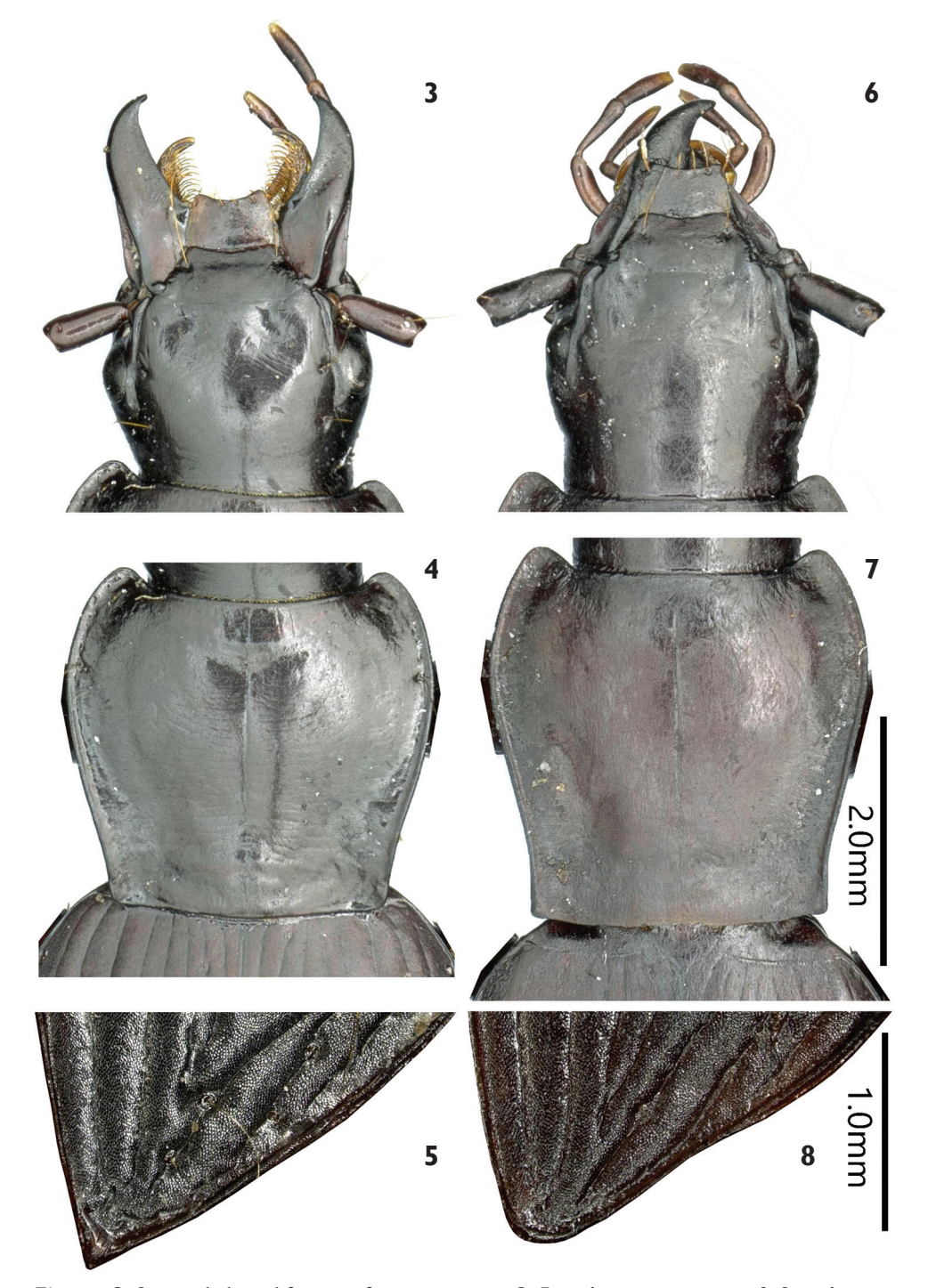
Figures 3–8. Morphological features of Laemostenus spp. 3–5 L. zhentangensis sp. nov. 6–8 L. zhamensis sp. nov. 3, 6 head 4, 7 pronotum 5, 8 sutural angle of elytron.