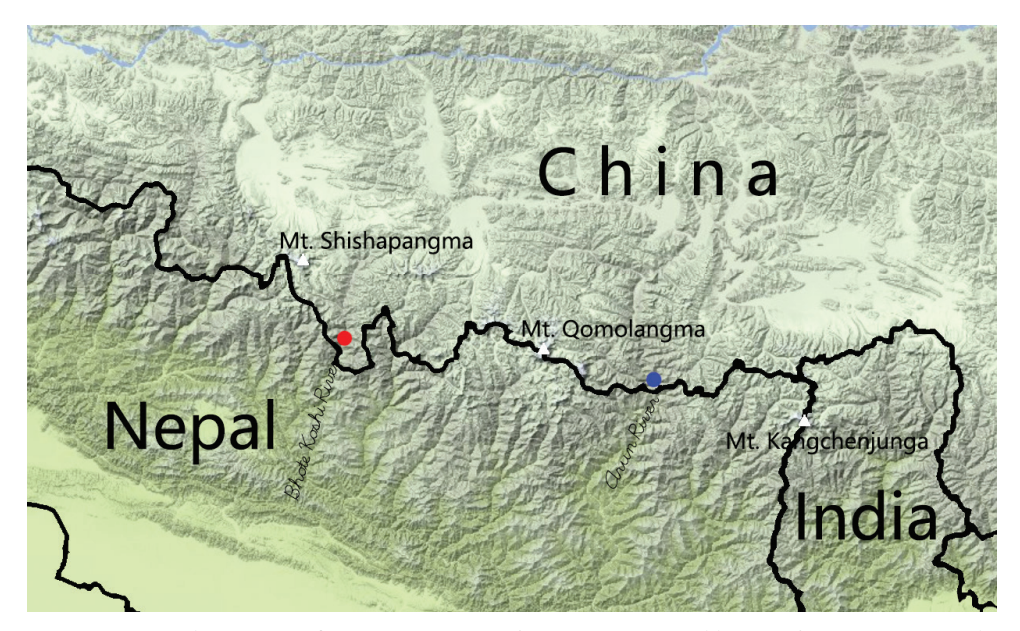
Figure 15. Distribution map of Laemostenus spp. L. zhentangensis sp. nov. (blue); L. zhamensis sp. nov. (red).

Venter. Propleuron, mesepisternum, and metepisternum smooth. Mesosternum not denticulate in front of mesocoxae. Metepisternum slightly longer than wide. All abdominal sternites with a few shallow wrinkles laterally, without ambulatory setae.