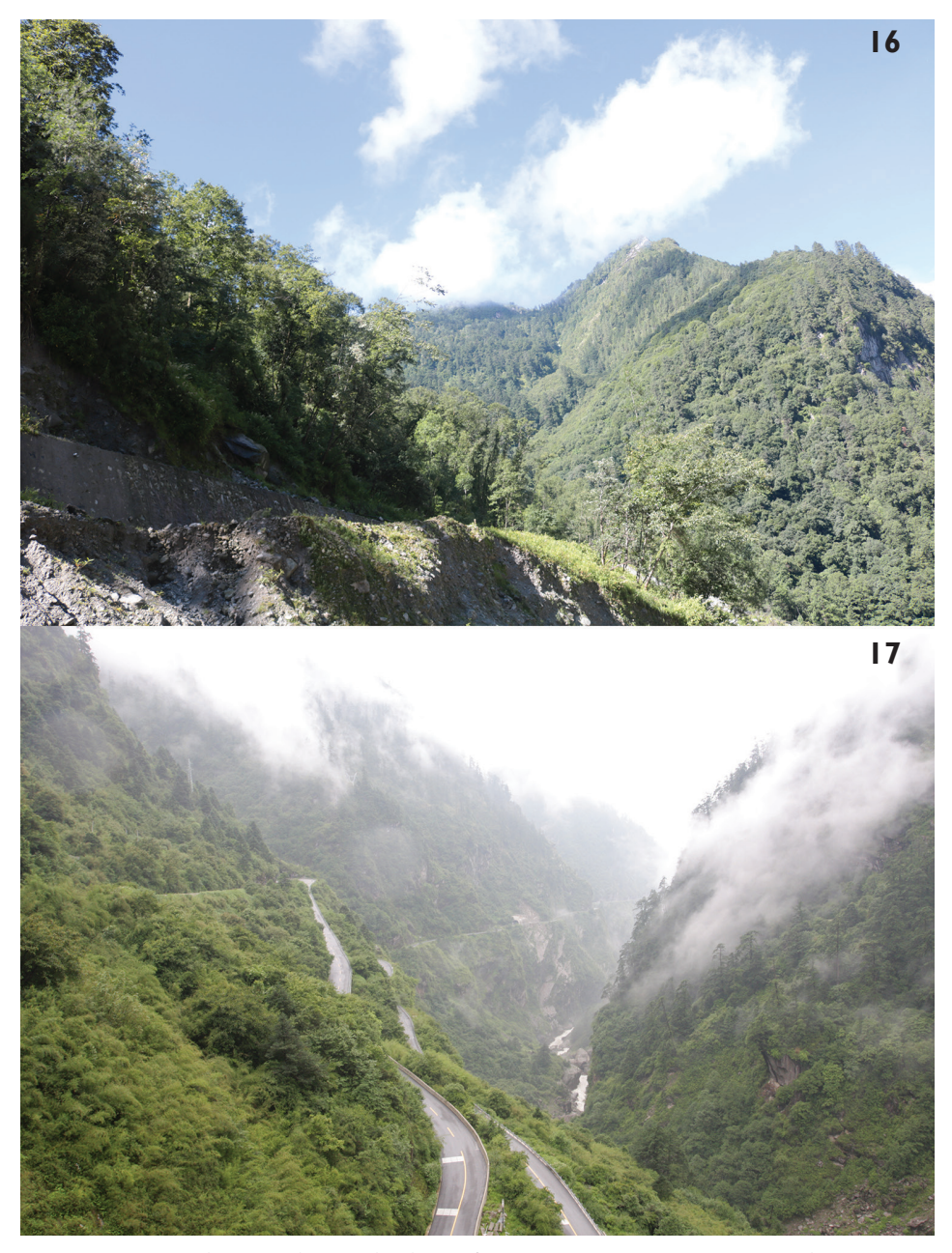
Figures 16, 17. Habitats in the type localities of Laemostenus spp. 16 Zangqiong, Zhêntang Town, Dinggyê County, Xigazê, Xizang, China; locality of L. zhentangensis sp. nov. 17 Nyalam County, 100 m below Zham Town, Xigazê, Xizang, China; locality of L. zhamensis sp. nov.

Distribution and habitat. This species is only known from Zham Town, Nyalam County, Xizang, China (Fig. 15). The only specimen was caught along road during day in a cloudy forest at 2163 m a.s.l. (Fig. 17).