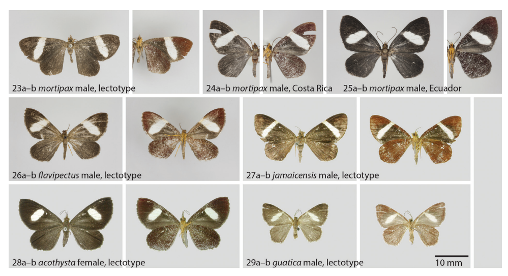
Figures 23–29. 23 Hagnagora moripax (Druce) male, lectotype a dorsal view b ventral view 24 H. mortipax male from Costa Rica as reference specimen with Barcode Index Number (BIN) a dorsal view b ventral view 25 H. mortipax male from Ecuador as reference specimen with Barcode Index Number (BIN) a dorsal view b ventral view 26 H. flavipectus (Warren) male, holotype a dorsal view b ventral view 27 H. mortipax jamaicensis (Schaus) male, lectotype a dorsal view b ventral view (photo USNM) 28 H. mortipax acothysta (Schaus) female, lectotype a dorsal view b ventral view (photo USNM) 29 H. guatica (Schaus) female, lectotype a dorsal view b ventral view (photo USNM).

Remarks. Originally described as a Heterusia species by Schaus (1901), this taxon was down-ranked as a subspecies of mortipax by Parsons et al. (1999). In my view, the significantly different wing pattern in jamaicensis justifies Schaus' original species rank, but further evidence from barcoding is desirable in order to consolidate its species status.