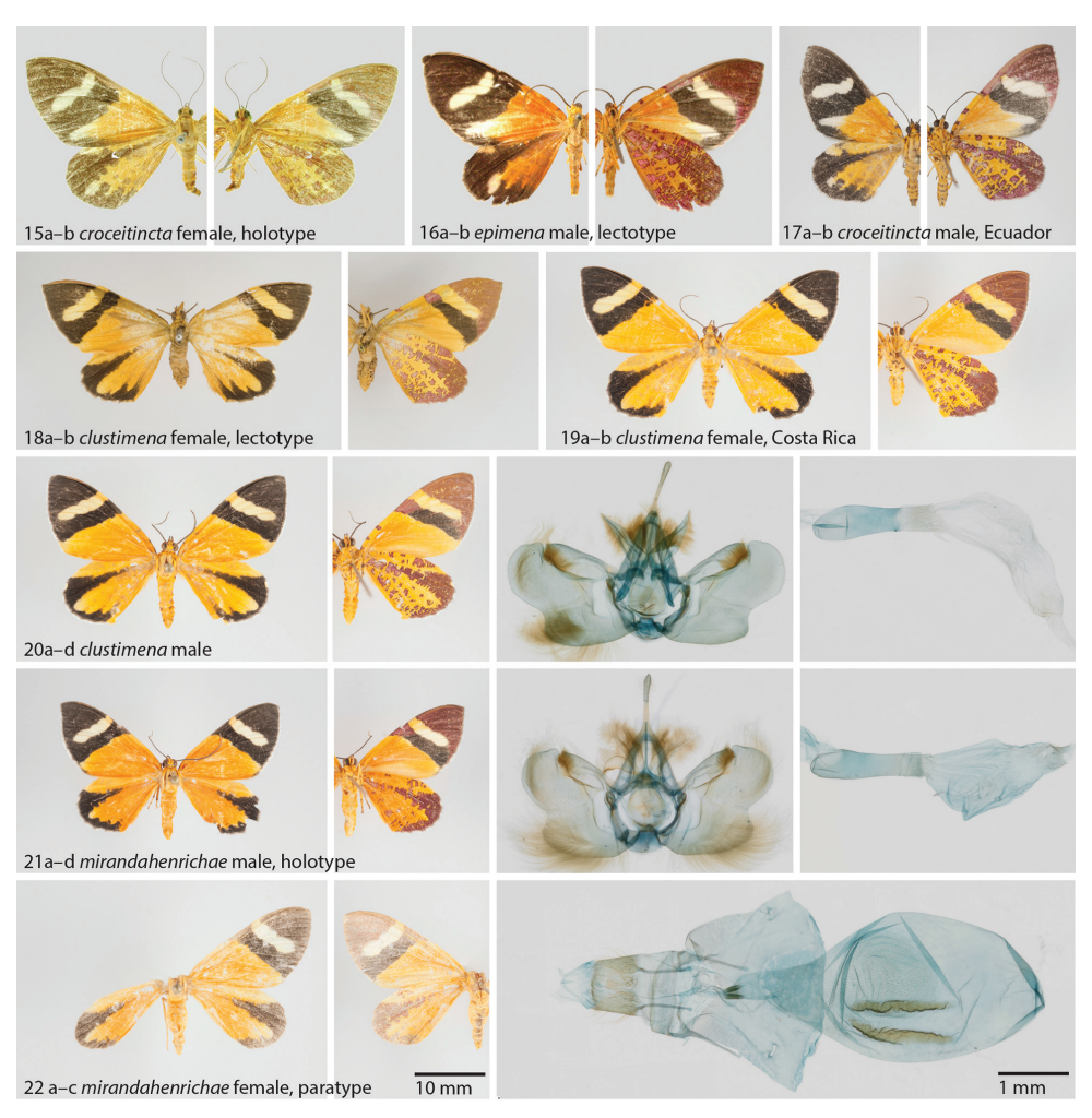
Figures 15–22. 15 Hagnagora croceitincta (Dognin) female, holotype a dorsal view b ventral view 16 H. epimena (Bastelberger) male, lectotype a dorsal view b ventral view 17 H. croceitincta male from Ecuador as reference specimen with Barcode Index Number (BIN) a dorsal view b ventral view 18 H. clustimena (Druce) female, lectotype a dorsal view b ventral view 19 H. clustimena female from Costa Rica as reference specimen with Barcode Index Number (BIN) 20 H. clustimena male from Costa Rica as reference specimen with Barcode Index Number (BIN) a dorsal view b ventral view c valvae d aedeagus 21 H. mirandahenrichae Brehm sp. n. male, holotype a dorsal view b ventral view c valvae d aedeagus 22 H. mirandahenrichae female, paratype a dorsal view b ventral view c genitalia.