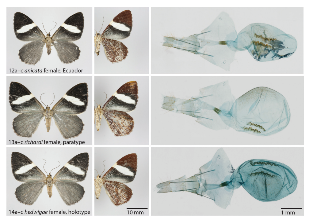
Figures 12–14. 12 H. anicata (F&R), female from Ecuador as reference specimen with Barcode Index Number (BIN) a dorsal view b ventral view c genitalia 13 H. richardi sp. n., female, paratype a dorsal view b ventral view c genitalia 14 H. hedwigae sp. n., female, paratype a dorsal view b ventral view c genitalia.

Type material. Holotype: male (Fig. 9): Ecuador, Loja province, Parque Nacional Podocarpus, Cajanuma, 04°06.85'S, 79°10.47'W, 2916 m, 20 November 2008, G. Brehm leg. (ID 18080, genitalia preparation, barcode sequence 658 bp) (PMJ).