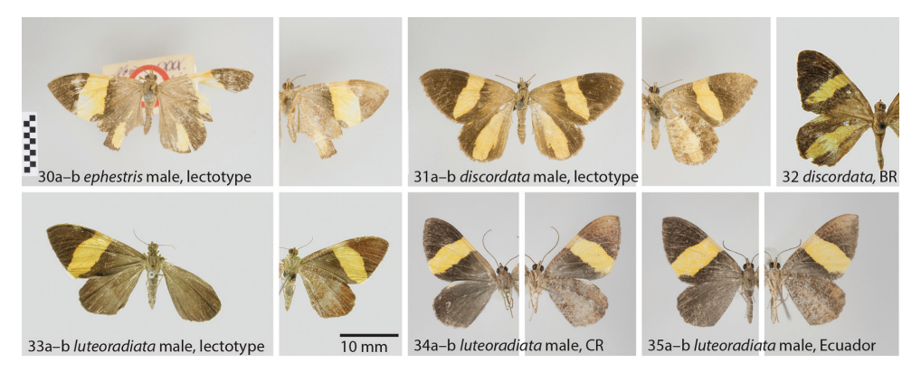
Figures 30–35. 30 Hagnagora ephestris (F&R) male, lectotype a dorsal view b ventral view 31 H. discordata male, lectotype a dorsal view b ventral view 32 H. discordata male (ZSM Lep 44128) from Brazil as reference specimen with Barcode Index Number (BIN) 33 H. luteoradiata (T-M) male, lectotype a dorsal view b ventral view 34 H. luteoradiata (T-M) male from Costa Rica (CR) as reference specimen with Barcode Index Number (BIN) a dorsal view b ventral view 35 H. luteoradiata (T-M) male from Ecuador as reference specimen with Barcode Index Number (BIN) a dorsal view b ventral view.

Diagnosis. Both ephestris and discordata show a pronounced yellow blotch on the hindwings that is absent in luteoradiata . Different from discordata , the yellow transversal band on the forewing of H. ephestris reaches the outer margin of the wing. Moreover, the band is broader than in discordata , whereas the yellow field of the hindwing is narrower, particularly in the proximate half of the wing.