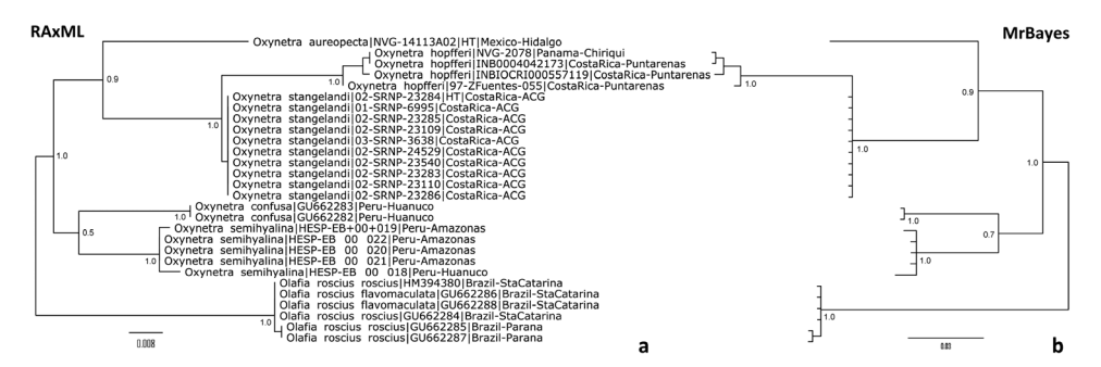
Figure 11. COI DNA barcode trees of Oxynetra species. The trees are obtained by a RAxML under "GTRGAMMA" model; and b MrBayes under "propinv" model with 2 states (see Materials and Methods) and show identical topology. The taxa are arranged in the same sequence in both trees. The trees are rooted with Olafia Nemésio, 2005 sequences. Bootstrap fractions (a) and posterior probabilities (b) are shown (except for nodes within species). Sequences with NVG- voucher codes were obtained in this work. For other sequences, ACG voucher codes (with -SRNP- and -ZFuentes-, Janzen & Hallwachs 2014), INBio voucher codes (starting with INB, Grishin et al. 2013), GenBank accessions (starting from GU and HM, http://genbank.gov/), or Ernst Brockmann collection voucher codes (with HESP-EB) are indicated for each sequence. The general locality of each specimen is indicated.

of this cell (the band prominently extends distad of M<sub>3</sub>-CuA<sub>1</sub> cell and the hyaline spot at the base of this cell is more prominent in the other two species); (4) longer (and narrower), streak-like spots in hindwing cells M<sub>3</sub>-CuA<sub>1</sub> and CuA<sub>1</sub>-CuA<sub>2</sub> (the spots, in particular the one in cell CuA<sub>1</sub>-CuA<sub>2</sub>, are rounder in the other two species); (5) five orange bands on the abdomen above, similarly to O. hopfferi (only a single complete band is present in O. stangelandi , Fig. 9); (6) a weakly developed white streak of a few hair-like scales near the anal fold on dorsal hindwing (the streak is absent in O. stangelandi , Fig. 9, but is well-defined in O. hopfferi , Figs 5, 7); (7) DNA COI barcode 6.1% and 4.7% different from that of O. hopfferi and O. stangelandi , respectively. Characters (1) and (3) appear to be the most easily observed. The female of O. aureopecta is unknown but may be mostly black similar to females of the other two species.