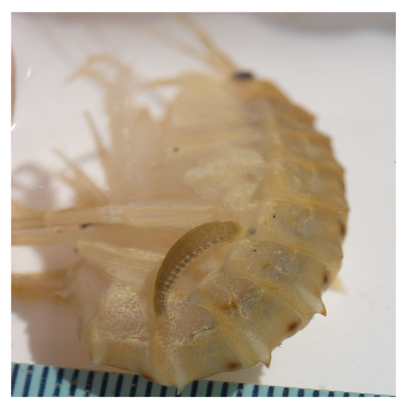
Figure 5. Codonobdella sp. on its host amphipod. The sample was found in the northern transit of the Maloe More Strait.

Order Arhynchobdellea Blanchard, 1894 Suborder Erpobdelliformes Sawyer, 1986 Family Erpobdellidae Blanchard, 1894