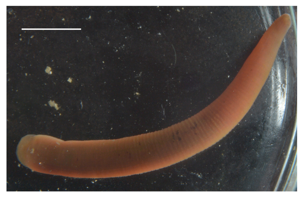
Figure 6. Erpobdella sp. 1 from Zagli Bay of the Maloe More Strait (Lake Baikal). Scale bar 5 mm.

tation is almost absent. There are only a few dark spots irregularly scattered on the dorsal surface (Fig. 6).