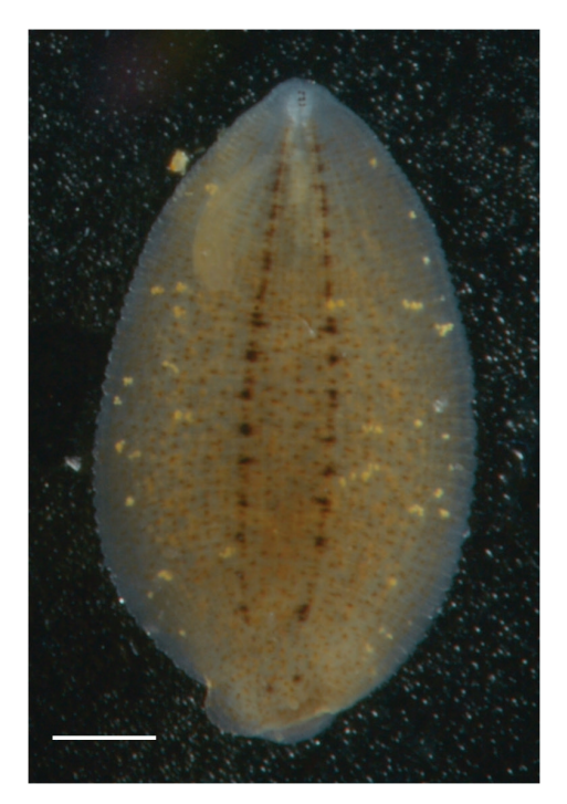
Figure 3. Glossiphonia sp. 2 from Kurma Bay of the Maloe More Strait (Lake Baikal). Scale bar 1 mm.