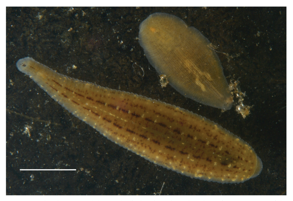
Figure 2. Glossiphonia sp. 1 (below) and Alboglossiphonia heteroclita (above) from Kurma Bay of the Maloe More Strait (Lake Baikal). Scale bar 10 mm.