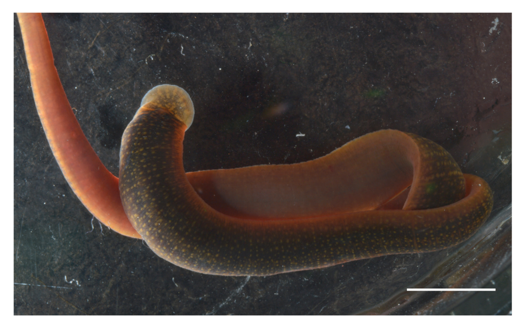
Figure 7. Erpobdella sp. 2 from Codoviy Bay (Maloe More Strait, Lake Baikal). Scale bar 5 mm.