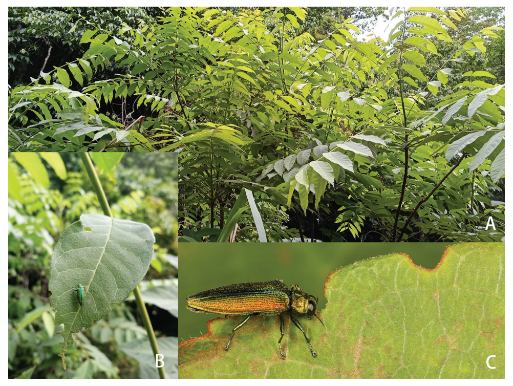
Figure 3. Host plant and habits of Coomaniella (Coomaniella) dentata sp. nov. A Toona sp. in the wild B marginal feeding of the leaf of Toona sp. by C. dentata C feeding habits.