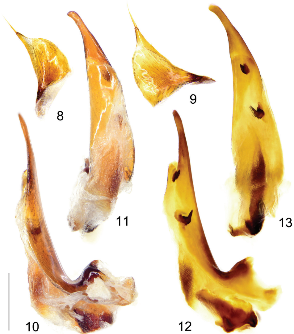
Figures 8–13. Himalopenetretus burangensis sp. nov. (holotype male, IZAS). 8 Right paramere of aedeagus 9 Left paramere of aedeagus 10–13 Median lobe of aedeagus, right lateral view ( 10, 12 ), ventral view ( 11, 13 ) 12, 13 were captured after the genitalia were treated with a 10% KOH solution for 12h to show features of the endophallus. Scale bar: 0.5 mm.

somere evidently bilobed; metatrochanter normal, not protruding or exceeding lateral margin of body; tarsomeres generally glabrous dorsally, only with a few very minute setae; the fifth meso- and metatarsomeres generally glabrous ventrally, with one to three pairs of minute setae (Fig. 7).