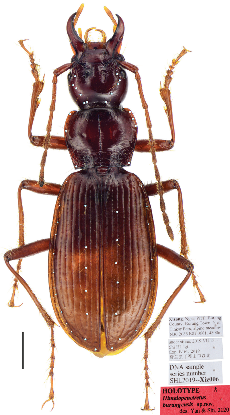
Figure 1. Himalopenetretus burangensis sp. nov. (holotype male, IZAS). Habitus and labels. Scale bar: 1.0 mm.