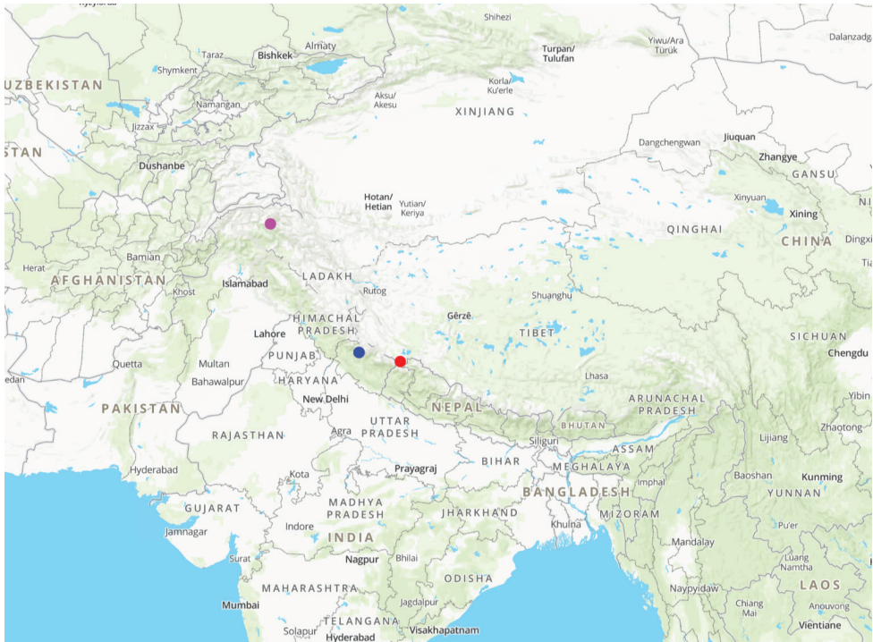
Map 2. Distribution map for Himalopenetretus species: H. burangensis sp. nov. (red); H. franzi (blue); H. falciger (magenta).

Thus, the generic diagnosis of this genus should be slightly modified to include the new species, as follows: pronotum lateral margins with two to five setae before middle.