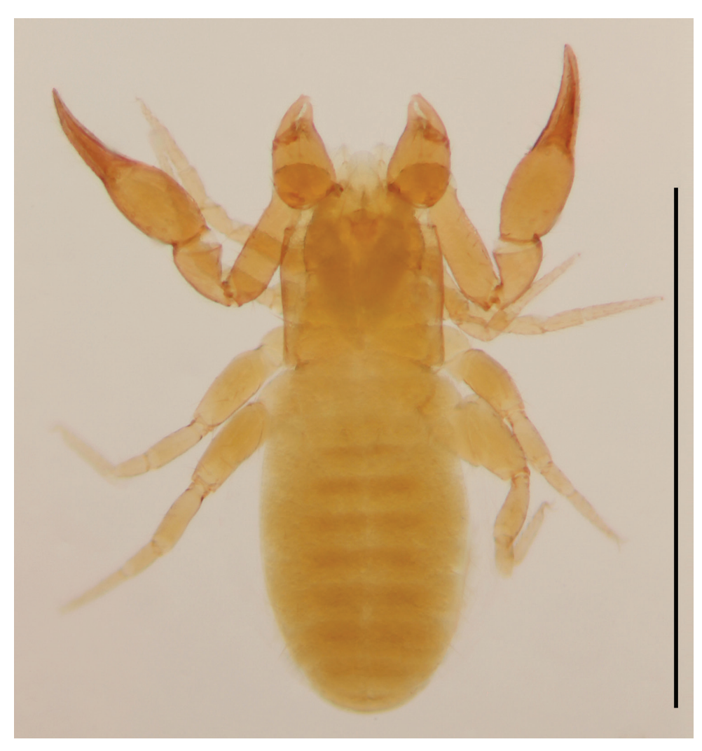
Figure 2. Lechytia novaezealandiae sp. nov., paratype female, dorsal. Scale bar: 1 mm.

(\mathcal{J}, \mathcal{Q}) ; tarsus 5.50× (\mathcal{J}) , 4.33× (\mathcal{Q}) deeper than broad. Legs robust, heterotarsate; tarsi with two elongate gland openings along the dorsal surface, each with crenulated margins (Fig. 3G); arolium slightly shorter than claws, claws simple.