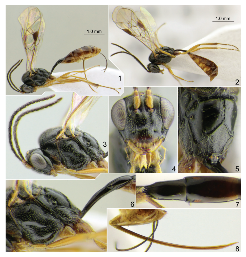
Figures 1–8. Meggoleus hidalgoensis sp. nov., holotype female (all except 2) and paratype male (2) 1, 2 habitus, lateral view 3 head with antennae and mesosoma, lateral view 4 head, front view 5 propodeum dorsopostero-lateral view 6 posterior part of mesosoma and base of metasoma, lateral view 7 postpetiole and second tergite, dorsal view 8 apex of metasoma with ovipositor, lateral view.

Pterostigma brown. Legs brownish yellow; hind coxa darkened with brown at base; apex of hind tibia and hind tarsus infuscate. First tergite brown to dark brown. Metasoma posterior to first tergite brown or dark brown dorsally to brownish yellow ventrally.