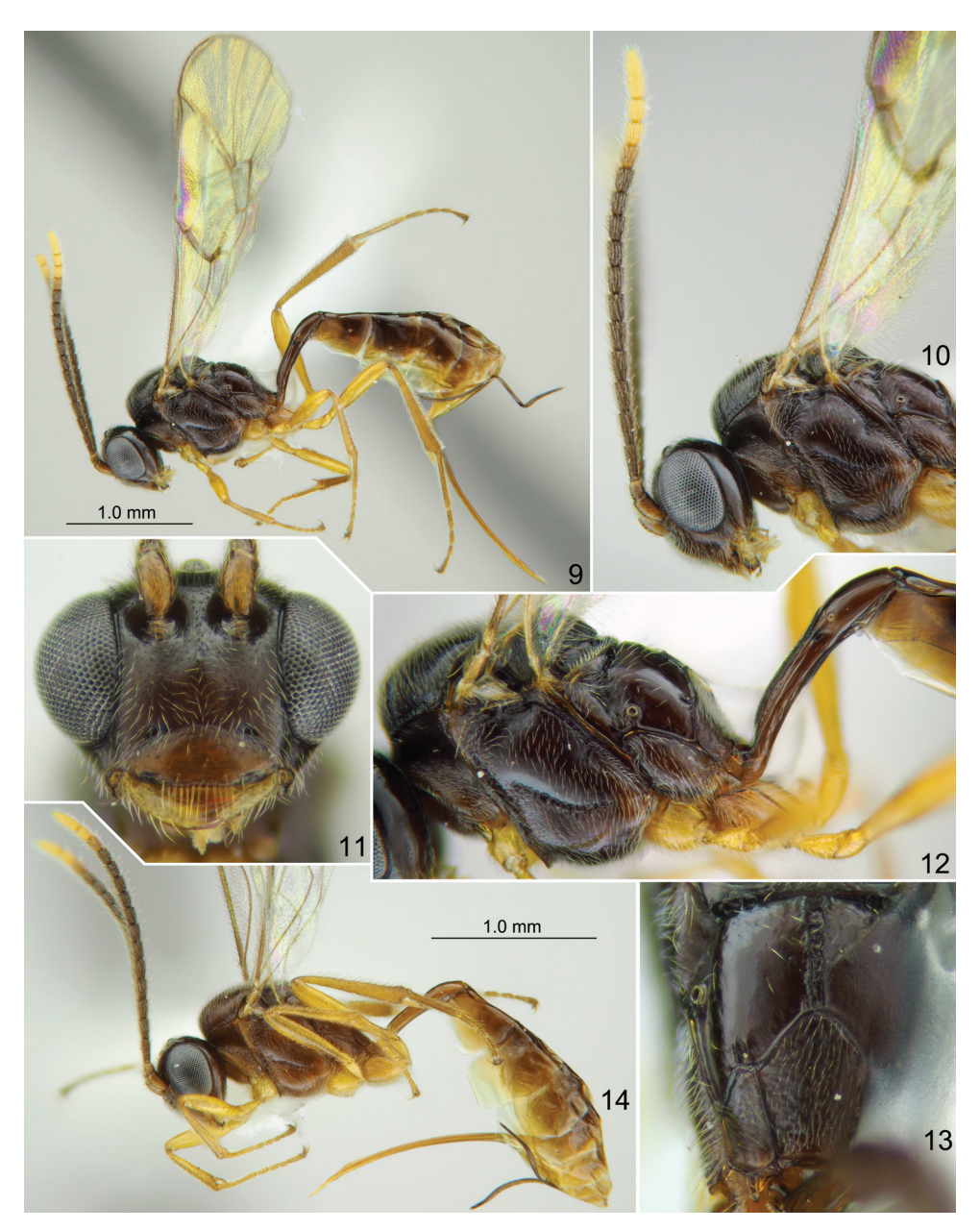
Figures 9–14. Meggoleus whartoni sp. nov., holotype (9–13) and paratype (14) females 9 , 14 habitus lateral view 10 head with antennae and mesosoma, lateral view 11 head, front view 12 mesosoma and base of metasoma, lateral view 13 propodeum, dorsal view.

tinct transverse wrinkles (Fig. 12). Mesopleuron smooth, with very fine inconspicuous punctures. Propodeal spiracle round, slightly enlarged, separated from pleural carina by 1.0-1.5 \times diameter of spiracle (Fig. 12). Propodeum with narrow median longitudinal furrow which is more or less enclosed laterally by a pair of longitudinal carinae,