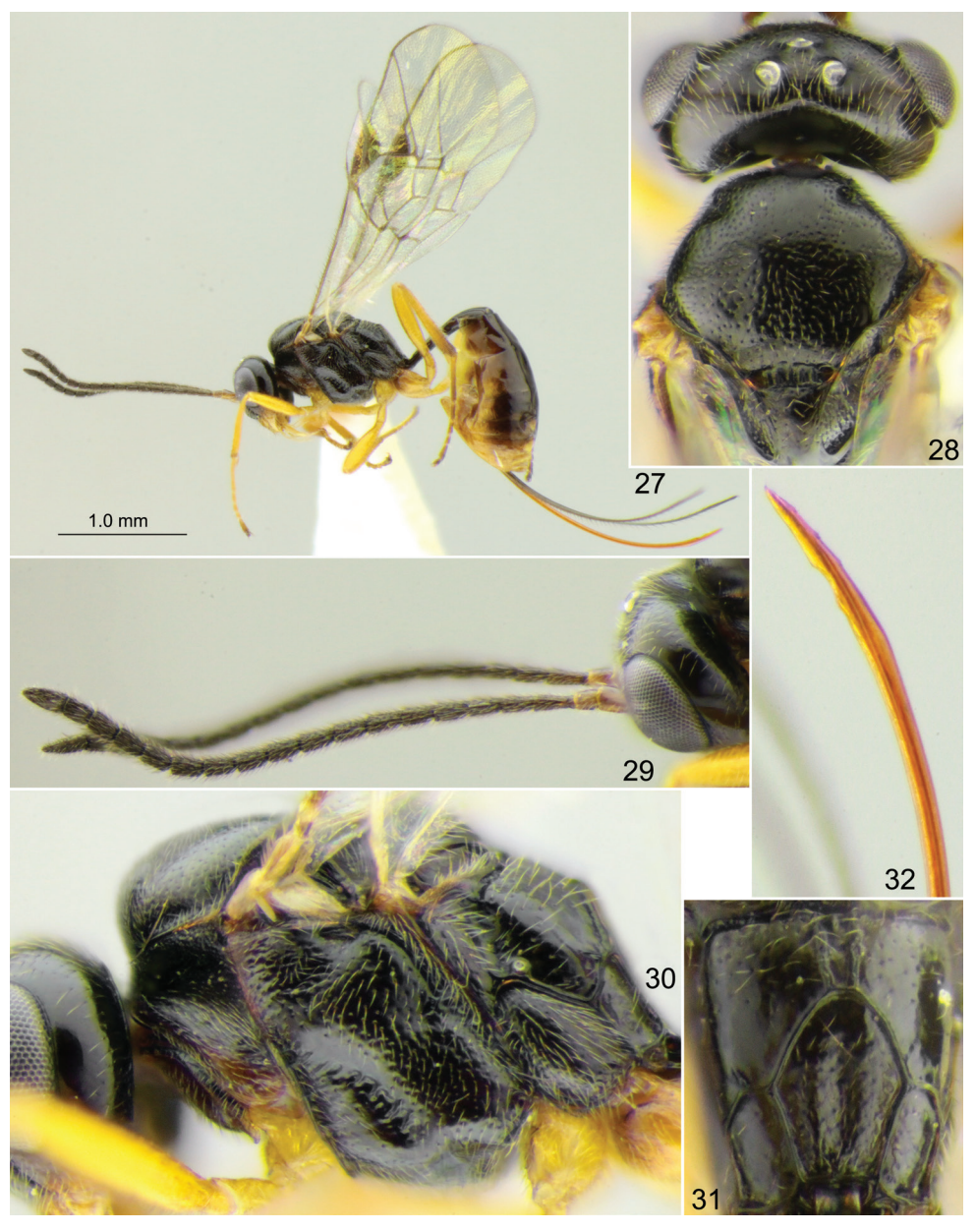
Figures 27–32. Stethantyx oaxacana sp. nov., holotype female 27 habitus, lateral view 28 head and mesoscutum, dorsal view 29 head with antennae, lateral view 30 head and mesosoma, lateral view 31 propodeum, dorsal view 32 apex of ovipositor, lateral view.

Paratypes. 7 females (3 in UNAM, 2 in UAT, 2 in ZISP), Mexico, Oaxaca, Santiago Comaltepec, 17.58424N, 96.49428W, 2427 m, Malaise trap, 12–20.VI.2007, coll. H. Clebsch.