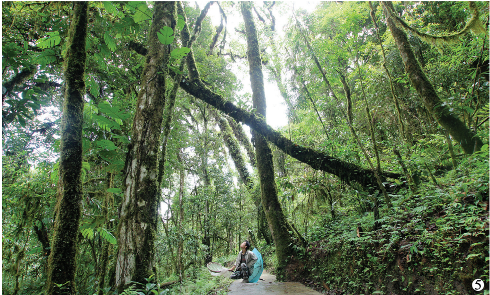
Figure 5. Habitat of Sarothrias sinicus Bi & Chen, sp. n., taken on the way from Baricun to Renqinbeng, Motuo, Xizang, alt. 1850 m.

subbasal depressions on each elytron, each depression with one squamiform setae posteriorly. Each elytron with striae or fine puncture forming 8 rows and 3 supplementary series (Fig. 4) of which 6 rows and 2 supplementary series are visible in dorsal view; rows 1 to 3 impressed at basal quarter and continued as a row of fine punctures, row 2 once again impressed after middle and connected with row 1 subapically, row 3 joined row 2 at apical one-third, rows 4 and 5 represented by fine punctures and disappearing anterior to apical one-third, row 6 largely impressed but intercepted by single puncture at basal one-third, rows 7 and 8 impressed, of which the former extending subapically and the latter starting at basal quarter and extending half of elytra length; three supplementary series (s1, s2, s3) represented by fine punctures, of which s1 present between rows 3 and 4 which starting at basal quarter and joined row 4 anterior to basal half, s2 (=s in Poggi 1991) present between rows 5 and 6 which starting at basal one-sixth and ending subapically, s3 separate from row 7 at basal two-fifths and ending subapically between row 6 and 7; apical half of row 2 and entire length of row 6 with secretions, of which the former secretory row with four squamiform setae asymmetrically arranged.