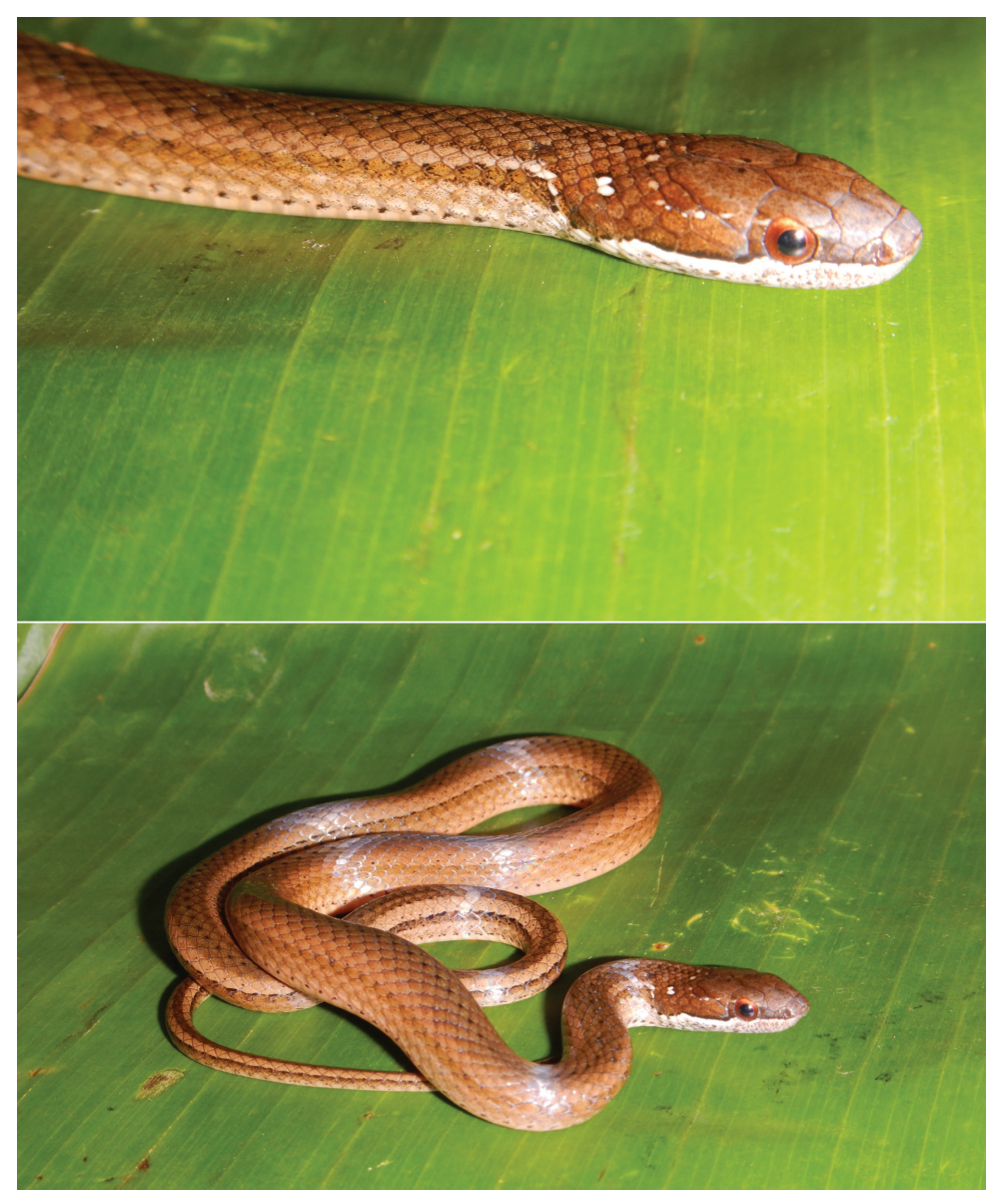
Figure 2. Adult male Coniophanes fissidens (MZFC-HE34194) from East of Río Santiago, Guerrero, Mexico. This specimen was obtained approximately 60 kilometers WNW of the type locality of C. f. dispersus. Compare this specimen with images 2, 3, and 4 from Mata-Silva et al. (2019).

ductions, number of preoculars, and teeth grooving) have been considered useful for differentiating Rhadinaea and Coniophanes (Bailey 1939; Cadle 1989; Myers 1974). As such, additional work including more comprehensive sampling of groups, the use of more molecular markers, and detailed revision of morphology is needed to explore their monophyly and evolutionary history.