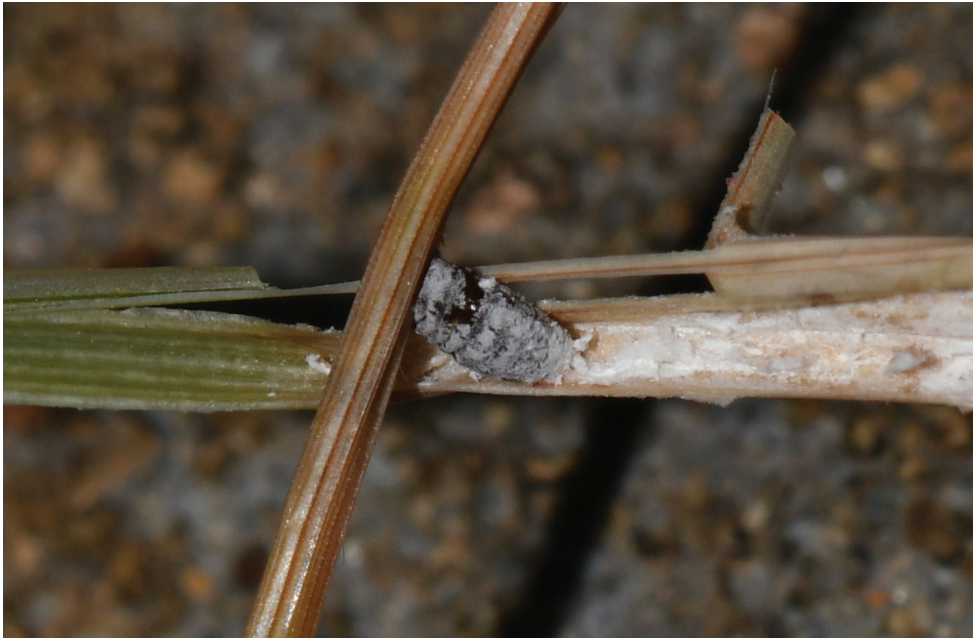
Figure 1. Habitus photograph of Atrococcus rushuiensis sp. nov. under the leaf sheath of Sporobolus fertilis (Poaceae).

267.5–289 \mu\text{m} long, lengths of each segment: I 42.5–52.5, II 37.5–38.8, III 23.8–27.5, IV 18.8–22.5, V 17.5–23.8, VI 20–26.3, VII 28.8–32.5 and VIII 65–76.3 \mu\text{m} . Eye spot located at body margin lateral to antennal base. Legs well developed; hind coxa 52.5–65 \mu\text{m} long, hind trochanter + femur 185–215 \mu\text{m} long, hind tibia + tarsus 198.8–240 \mu\text{m} long; claw 17.5–22.5 \mu\text{m} long, both tarsal digitules and claw digitules knobbed, longer than claw. Ratio of lengths of hind tibia + tarsus to hind trochanter + femur 1.07–1.14:1. Ratio of lengths of hind tibia to tarsus 1.49–1.69:1. Translucent pores present, minute duct-like, present on anterior and posterior surface of hind coxa. Circulus absent. Clypeolabral shield 125–145 \mu\text{m} long. Labium with three segments, 62.5–70 \mu\text{m} long. Ostioles moderately developed, each lip with 4–13 trilocular pores and 0–2 short setae. Anal ring normal, 61.3–70 \mu\text{m} in diameter, bearing six long setae, each seta 82.5–103.8 \mu\text{m} long. Cerarii numbering a single pair on anal lobes only. Anal lobe cerarii ( C_{18} ) each containing two slender conical setae, each seta 18–21 \mu\text{m} long, with 2–3 auxiliary setae, and 4–5 trilocular pores near conical setae base, all situated on a membranous area.