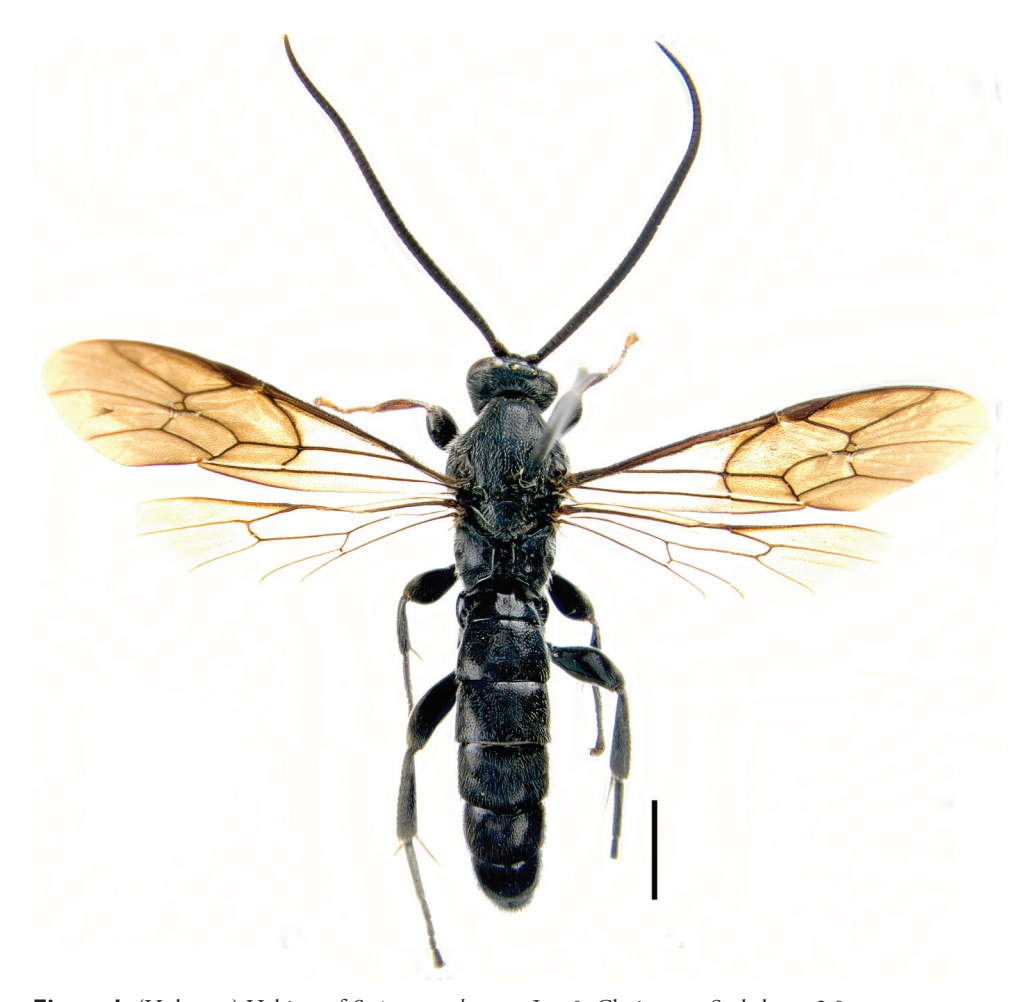
Figure 1. (Holotype) Habitus of Seticornuta koreana Lee & Choi, sp. n. Scale bar = 2.0 mm.

pleural carina lobed. Metapleuron glabrous, impunctate, its lower front ridge strongly projecting as a tooth above mid coxa. Fore wing with petiolate areolet, length of stalk as long as 2rs-m. Hind outer angle of second discoidal cell sharp. Fore wing vein cu-a curved (Fig. 3G). Hind wing with 11 distal hamuli. Nervellus inclivous, intercepted distinctly below middle. Legs very stout. Hind femur coarsely punctate, 2.5 times as long as wide. Ratio between lengths of hind tarsomeres 63:21:18:11:20. Spurs of mid tibia of equal length. Tarsomeres 2–4 of fore leg shorter than wide. Longer spur of hind tibia 0.5 times as long as basitarsus. Propodeum with very strong median longitudinal and apical transverse carinae (Fig. 3I). Combined basal area and area superomedia with parallel sides. Basal area separated from area superomedia by weak carina in some specimens (Fig. 3I). Costula absent. Lateral area punctate except in anterior inner part. Propodeal spiracle 3.0 times as long as wide, joining pleural carina.