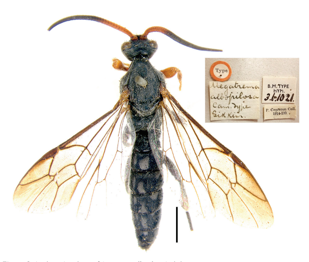
Figure 2. (Holotype) Habitus of Seticornuta albopilosa . Scale bar = 2.0 mm.

Mesosoma. Flattened, 2.0 times as long as high in lateral view. Lower part of pronotum smooth, impunctate, epomia weak. Pronotum rounded in dorsal view (Fig. 3E, dotted line and arrow). Mesoscutum elongate with sparse punctures, rounded in lateral view (Fig. 3F, dotted line and arrow), notaulus weak. Scutellum flat with lateral carinae. Epicnemial carina strong, reaching subtegular ridge. Areolet of fore wing present, with stalk shorter than vein 2rs-m; fore wing vein cu-a curved (Fig. 3H). Hind wing with 11 distal hamuli. Nervellus inclivous, intercepted distinctly below middle. Legs very stout. Hind femur coarsely punctate, 3.0 times as long as wide. Spurs of mid leg with of equal length. Tarsomeres 2–4 of fore leg shorter than wide. Propodeum with very strong median longitudinal and apical transverse carinae. Combined basal area and area superomedia convergent apically. Basal area not separated from carina. Costula absent. Propodeal spiracle 3.7 times as long as wide, joining pleural carina.