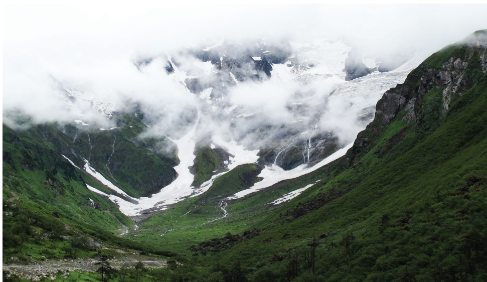
Figure 7. Natural environment of collecting localitiy of Metaeuchromius glacialis Li, sp. n.

with snow; the vegetation on the south slope is a blend of alpine meadows, shrubs and conifer trees (Fig. 7).