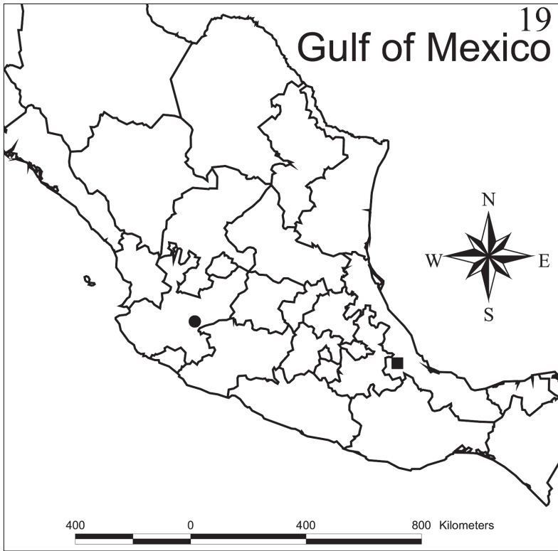
Figure 19. Collection sites of Myrmedonota cordobensis Santiago-Jiménez, sp. n. (black square) and M. jaliscensis Santiago-Jiménez, sp. n. (black circle).

(around 6 denticles), and one lateral protrusion on each side of the midline. Tergite VIII of female (Fig. 12) is not crenate and it has a lateral protrusion. Sternite VIII of male and female as illustrated in Figures 13 and 14, respectively.