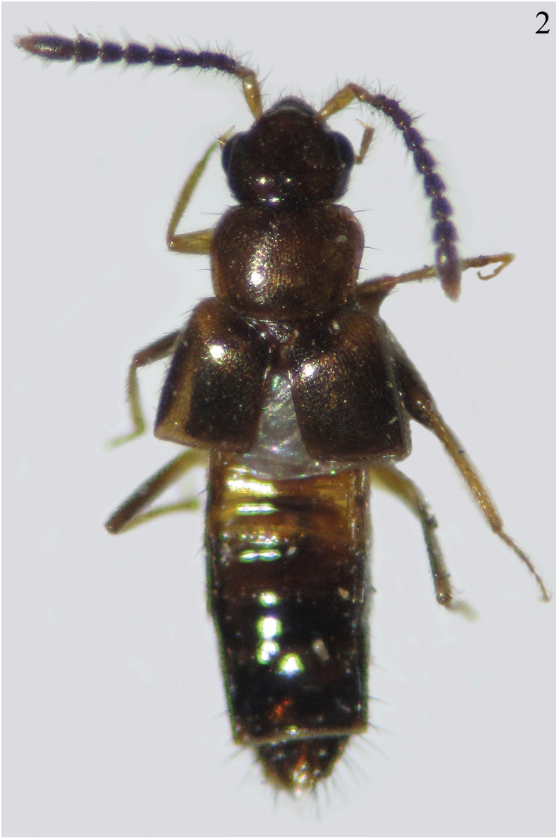
Figure 2. Habitus of Myrmedonota jaliscensis Santiago-Jiménez, sp. n., male.

\alpha -sensilla, medial or \beta -sensilla, posterior or \gamma -sensilla, and lateral or \epsilon -sensilla, one on each side of the midline (see Ashe 1984, Santiago-Jiménez 2010); apico-medial margin of epipharynx not modified to setose or spinose process; basal region of epipharynx with six pores more or less in one transverse row; medial region of epipharynx with around 30–32 pores in an irregular array; mesal region of epipharynx without a multiporose sensory structure on each side of midline; with several pores (around 8)