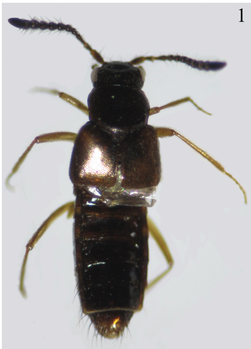
Figure 1. Habitus of Myrmedonota cordobensis Santiago-Jiménez, sp. n., male.

mandibles; with large velvety patch wider than half of mandible base, composed of small denticles; prostheca with short setae along entire length, except base, which has a ctenidium; prosthecal setae not bifurcated in medial area. Maxilla: with a row of seven spines and two rows of large setae contiguous with the apical spines on apical third of the lacinia, between two rows of setae there is a glabrous area; the two rows of setae continue with numerous setae on middle third of the lacinia; practically glabrous on the basal third of the lacinia; with pseudopores on the cardo. Labium: with short ligula and divided near base; with a small pair of setulae on each lobe of the ligula (one very