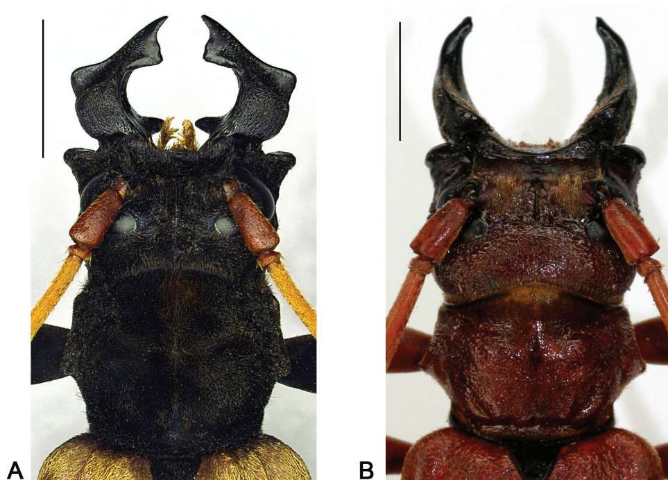
Figure 2. Dorsal view head and pronotum, scale bars 5 mm A Hexamitodera (Sulcognatha) blairi comb. n., male, Indonesia, Central Sulawesi, Puncak B Parandrocephalus eversor , male, Malaysia, Cameron Highlands, Kampong Rajah.

http://species-id.net/wiki/Hexamitodera_blairi