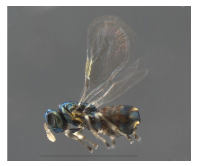
Figure 2. Ophelimus sp. Body in lateral view. Scale bar: 1 mm.

Body length of the Ophelimus reported here (Fig. 2) range from 1 to 1.1 mm, body color dark brown with metallic shine, and both eyes and ocelli are dark. Legs are dark brown except for the apical region of the femur and tibia and the three first tarsomeres of the meso and metathoracic legs, which are pale. Fore wings have one or two setae on the submarginal vein. Antennal scape is a dark color with flagellomeres and clava being pale brown.