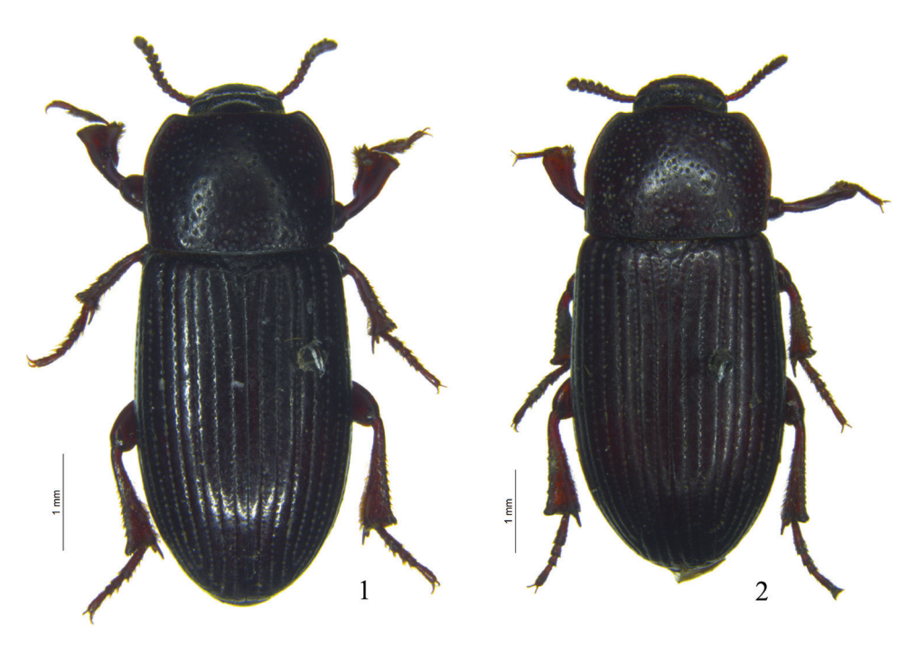
Figures 1-2. Ulomimus indicus Bates, 1873. I Male 2 female.

paler. Head transverse, with small punctures on anterior half, and with sparse large punctures on posterior half; labrum transversely rectangular, densely punctate, scattered with short and yellow hairs; clypeus densely punctate, anterior margin truncate; frontoclypeal suture deeply impressed; genae feebly convex and slightly extended, temples reduced; eyes transverse, with 5–6 facets at narrowest point in lateral view; frons weakly convex, with large punctures; mentum (Fig. 4) cordate, truncate basally, with short and very dense yellow pubescence; ligula deeply emarginate anteriorly, depressed in middle; maxillary palp with narrowly trapezoidal terminal palpomere. Antennae (Fig. 3) short, not reaching half of pronotum; antennomere 1 thick, 2 very short, 3 long and narrow, 4 and 5 short, 6 to 10 gradually widening, 11 nearly globose, ratio of the length (width) of antennomeres 2–11 as follows: 4 (6): 8 (6): 5 (7): 5 (7): 5 (8): 4 (9): 5 (10): 5 (12): 5 (11): 11 (11). Antennomere 6 with one placoid sensorium on inner anterior corner, 7 with two placoid sensoria on inner corner, 8 to 9 with a few on inner and outer corners.