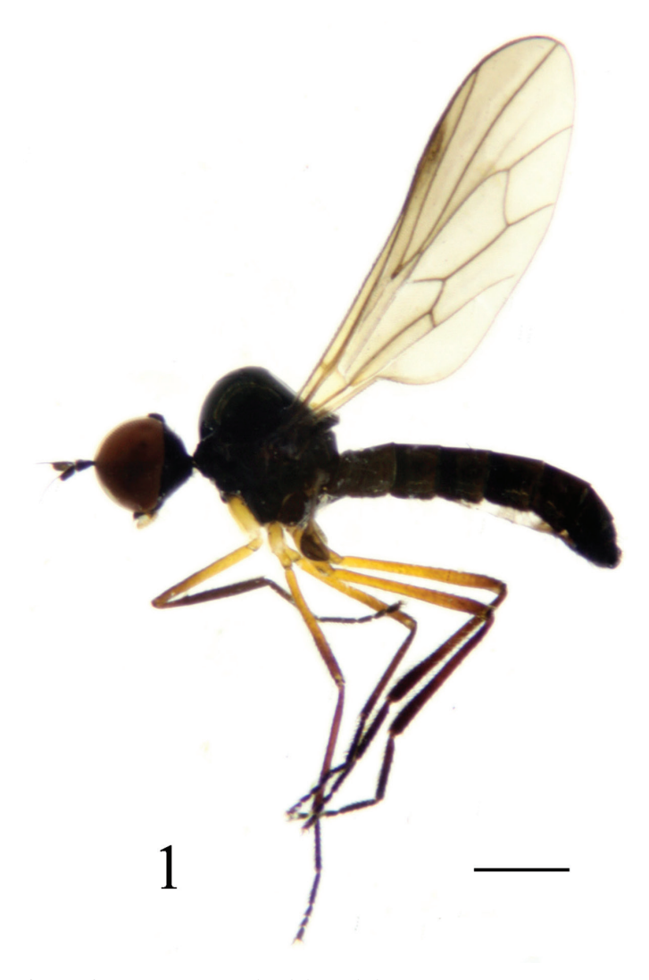
Figure 1. Ocydromia shanxiensis sp. n., male adult. Scale bar 1 mm.

short, mostly brownish yellow, with black setulae; palpus black with black setulae and 2 thin black setae.