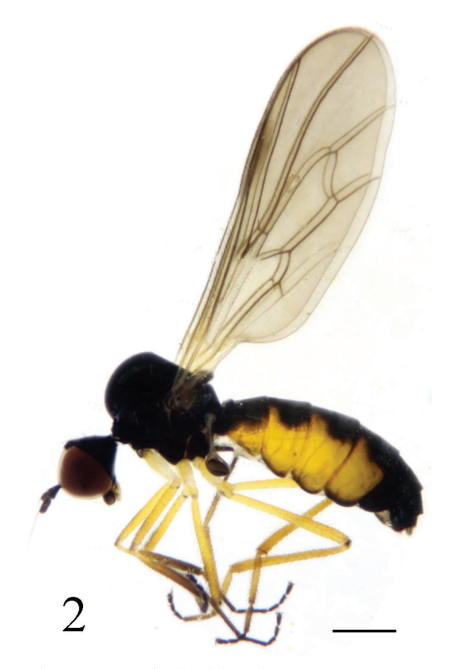
Figure 2. Ocydromia shanxiensis sp. n., female adult. Scale bar 1 mm.

femur brownish. Setulae and setae on legs blackish, setae weak; coxae with yellow setulae and setae, hind femur with hair-like av slightly longer than femur thickness. Senseorgan of fore tibia with narrow hair brush pointed apically (Fig. 4). Hind tibia distinctly thickened apically; hind tarsomere 1 slightly thickened, slightly shorter than tarsomeres 2–5. Wing (Fig. 3) hyaline, tinged gray; stigma dark brown, about 1/4 as long as cell r,; veins dark brown. Squama dark brown with dark brown setulae. Halter dark brown.