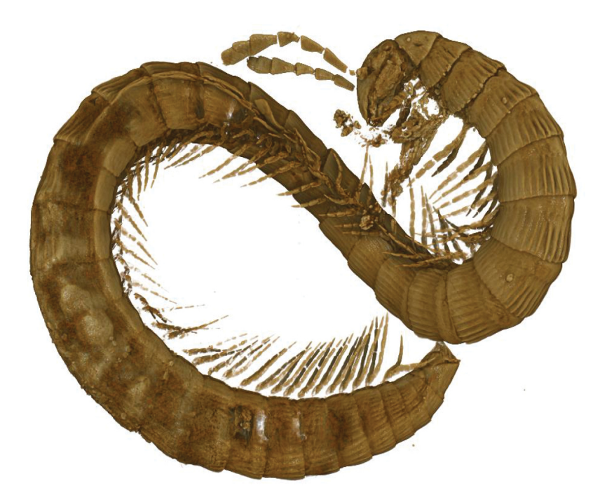
Figure 3. Burmanopetalum inexpectatum gen. nov. et sp. nov., female holotype (ZFMK-MYR07366), 3D model, volume rendering.

prefemur (Fig. 1F). Tarsus 2 with a short claw. Leg 1 and 2 not visibly modified. Some midbody legs with coxal vesicles.