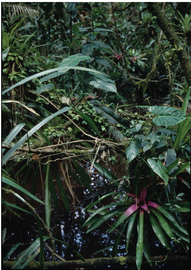
Figure 4. Habitat of L. sanguineus sp. nov. in 1988.

with metallic blue to greenish-blue vertical vermiculate marks; broad golden stripe on distal margin of dorsal fin. Pelvic fin red with bright blue margin. Pectoral fin hyaline.