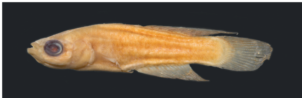
Figure 1. Leptopanchax sanguineus sp. nov., MNRJ 51331, holotype, male, 20.9 mm SL. Scale bar: 5 mm.