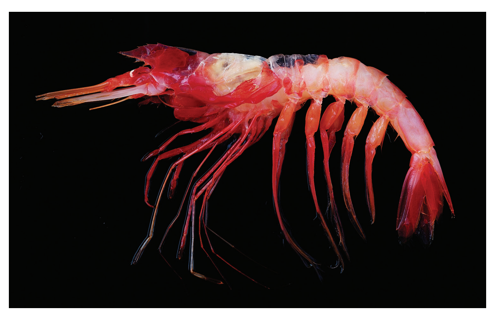
Figure 1. Benthesicymus crenatus Bate, 1881, stn CP413, 4412–4446 m, male cl 34.2 mm (NTOU M02183).

"TAIWAN 2012", stn CP465, 22°37.56'N, 122°32.23'E, 5004–4996 m, 01 Jul 2012, 1 male cl 40.8 mm (NTOU M02187); stn CP466, 22°47.86'N, 122°29.72'E, 5226–5314 m, 02 Jun 2012, 2 males cl 28.1–33.3 mm, 3 females cl 20.1–37.3 mm (NTOU M02188); stn CP467, 22°48.01'N, 122°29.69'E, 5227–5154 m, 02 Jun 2012, 4 males cl 23.8–30.7 mm, 4 females cl 13.7–39.1 mm (NTOU M02189).