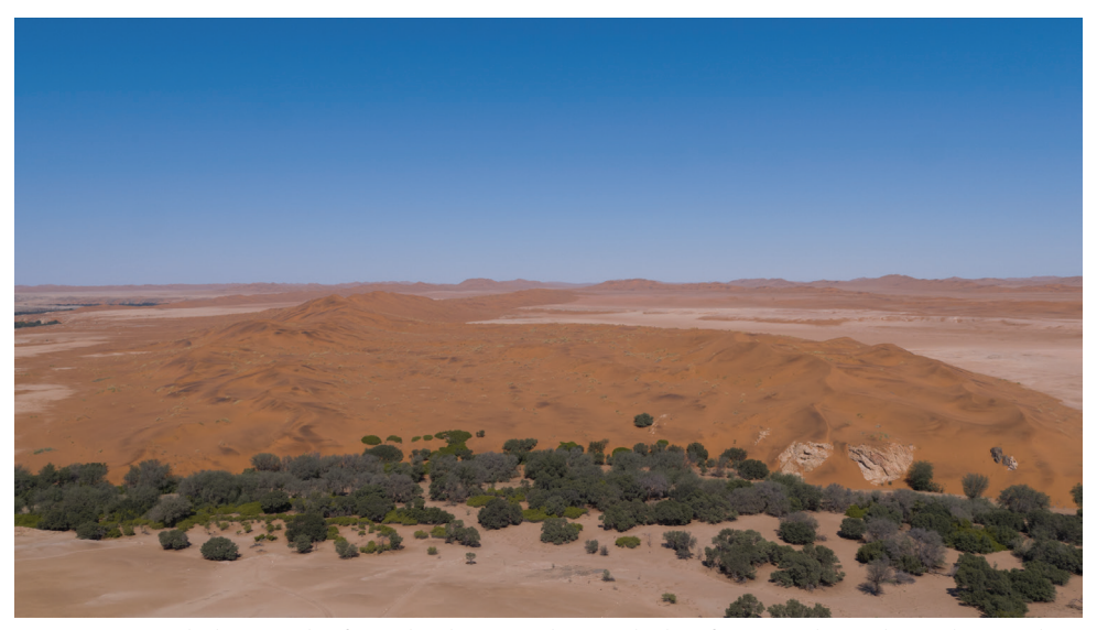
Figure 1. Aerial photograph of type locality. Kuiseb River bed in foreground (tree line); the interdune pitfall trap transect lies beyond the dunes (middle right of image).

central western Namibia; the type locality at the Gobabeb Research & Training Center is about 120 km southeast of the Atlantic coastal city of Walvis Bay. The description of this new species extends the distribution of Pionothele significantly northward, indicating that the genus may contain considerable undescribed diversity, particularly in the intervening areas.