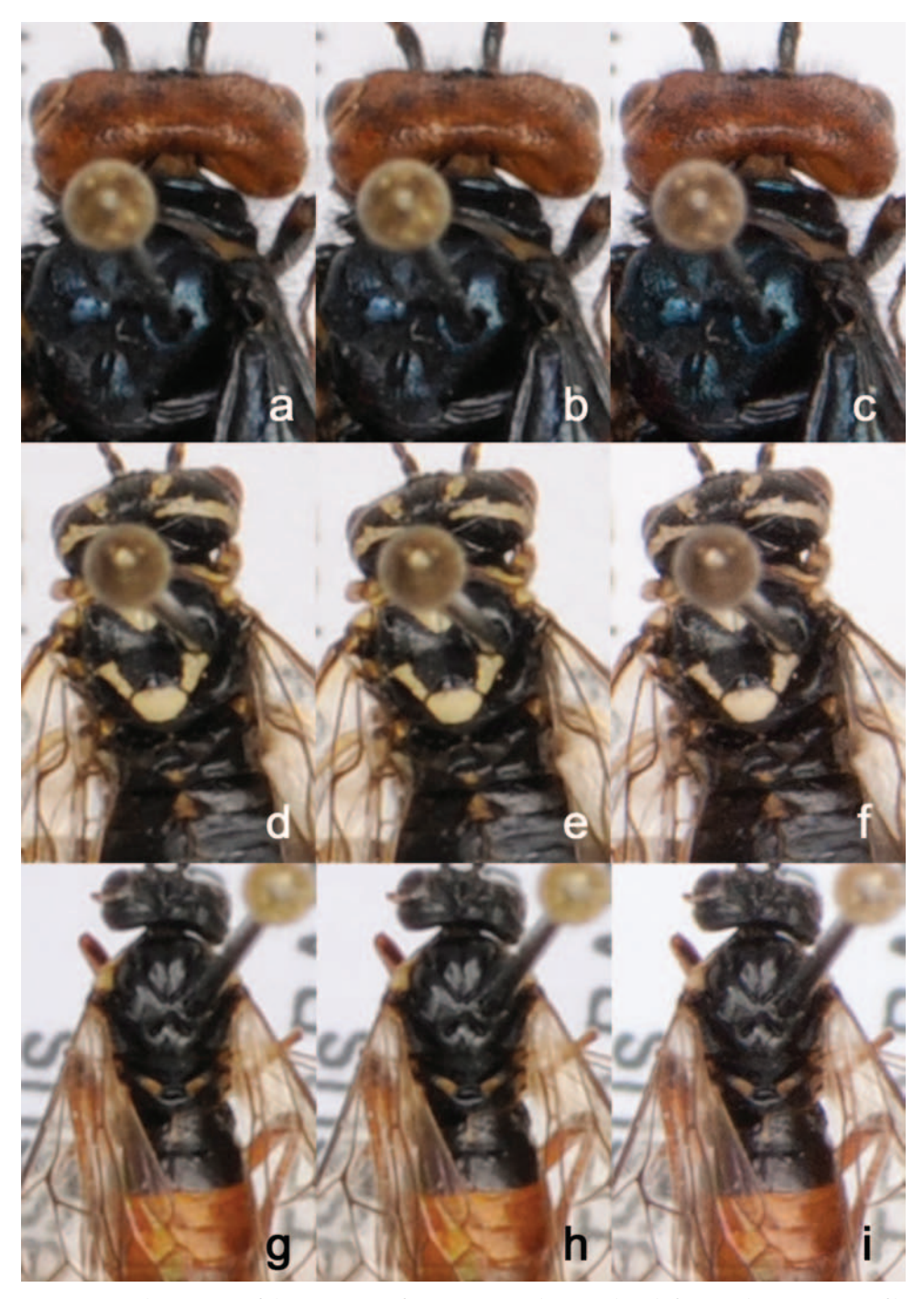
Figure 3. Enlargements of drawer images from Fig. 1 to show quality differences between image file formats. Each of the three specimens was captured in JPEG ( a , d , g ), TIFF ( b , e , h ), and RAW ( c , f , i ). A high resolution version of the image is available under media.zsm-entomology.de/suppl/zookeys_mass_ digitisation_volume/Fig_3.png