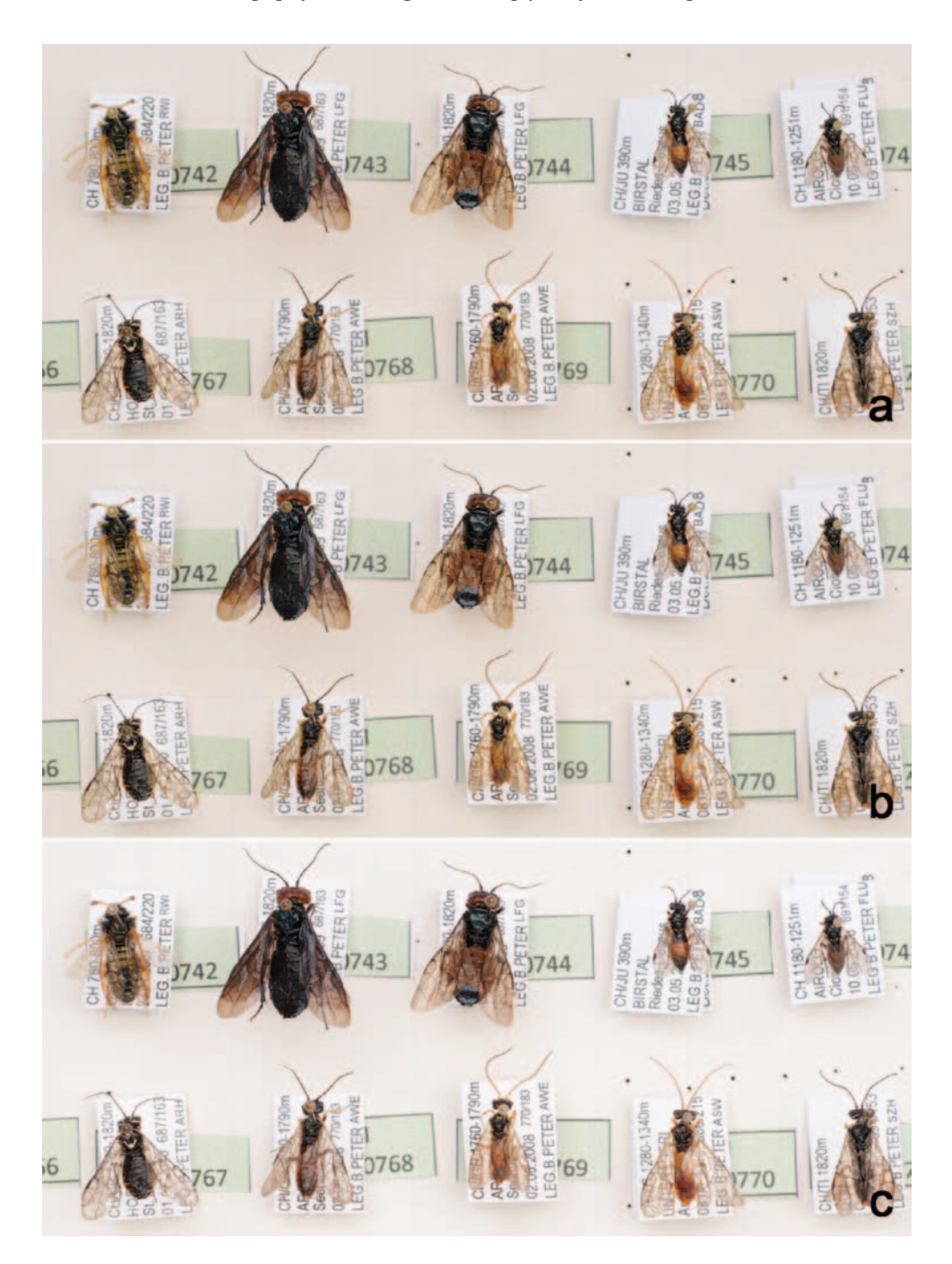
Figure 2. Partial drawer images taken at the same position using three different file formats: captured as JPEG ( a ), captured as TIFF ( b ), and TIFF converted from RAW ( c ). A high resolution version of the image is available under media.zsm-entomology.de/suppl/zookeys_mass_digitisation_volume/Fig_2.png