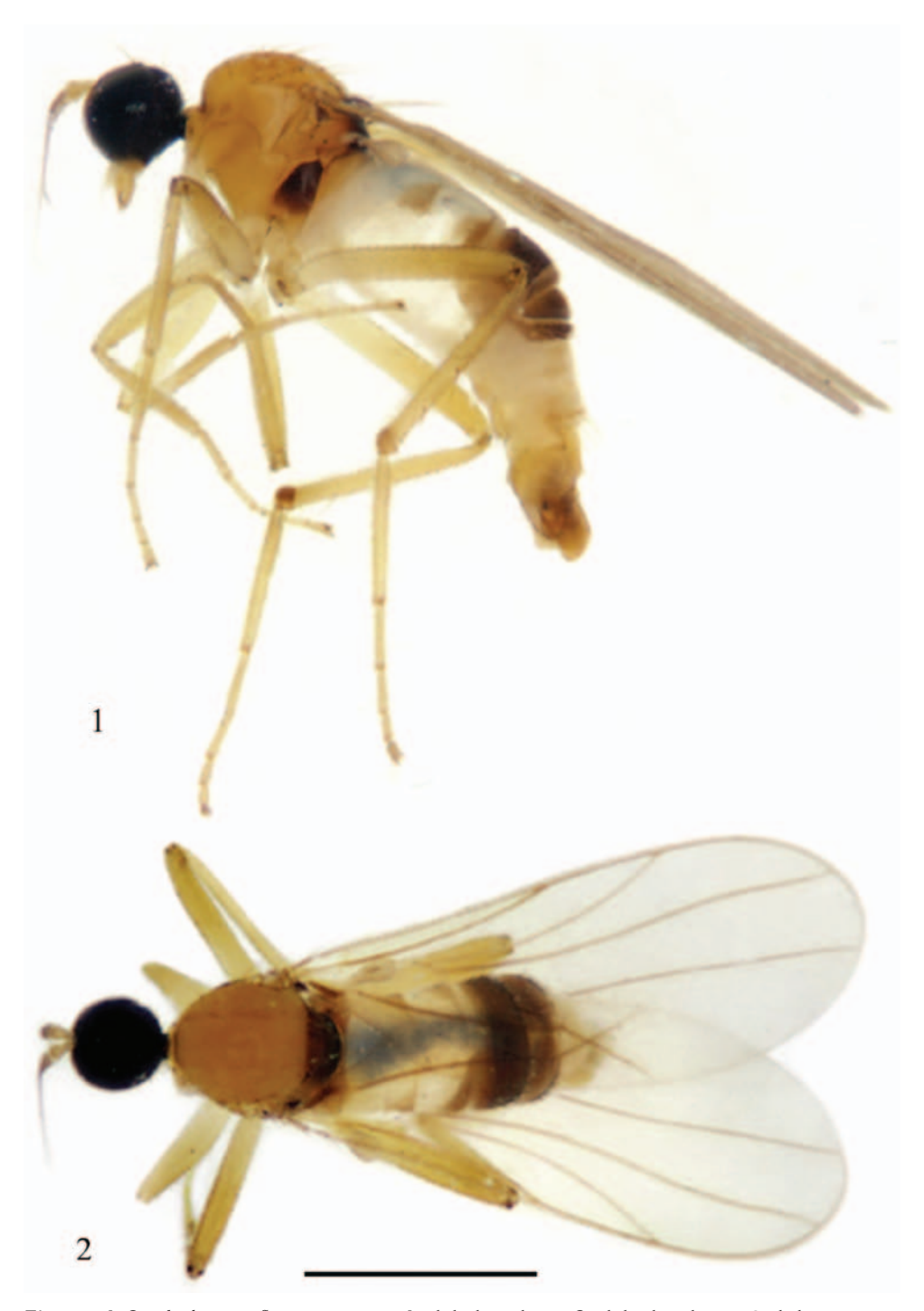
Figures 1–2. Elaphropeza flaviscutum sp. n. 1 adult, lateral view 2 adult, dorsal view. Scale bar 1 mm.