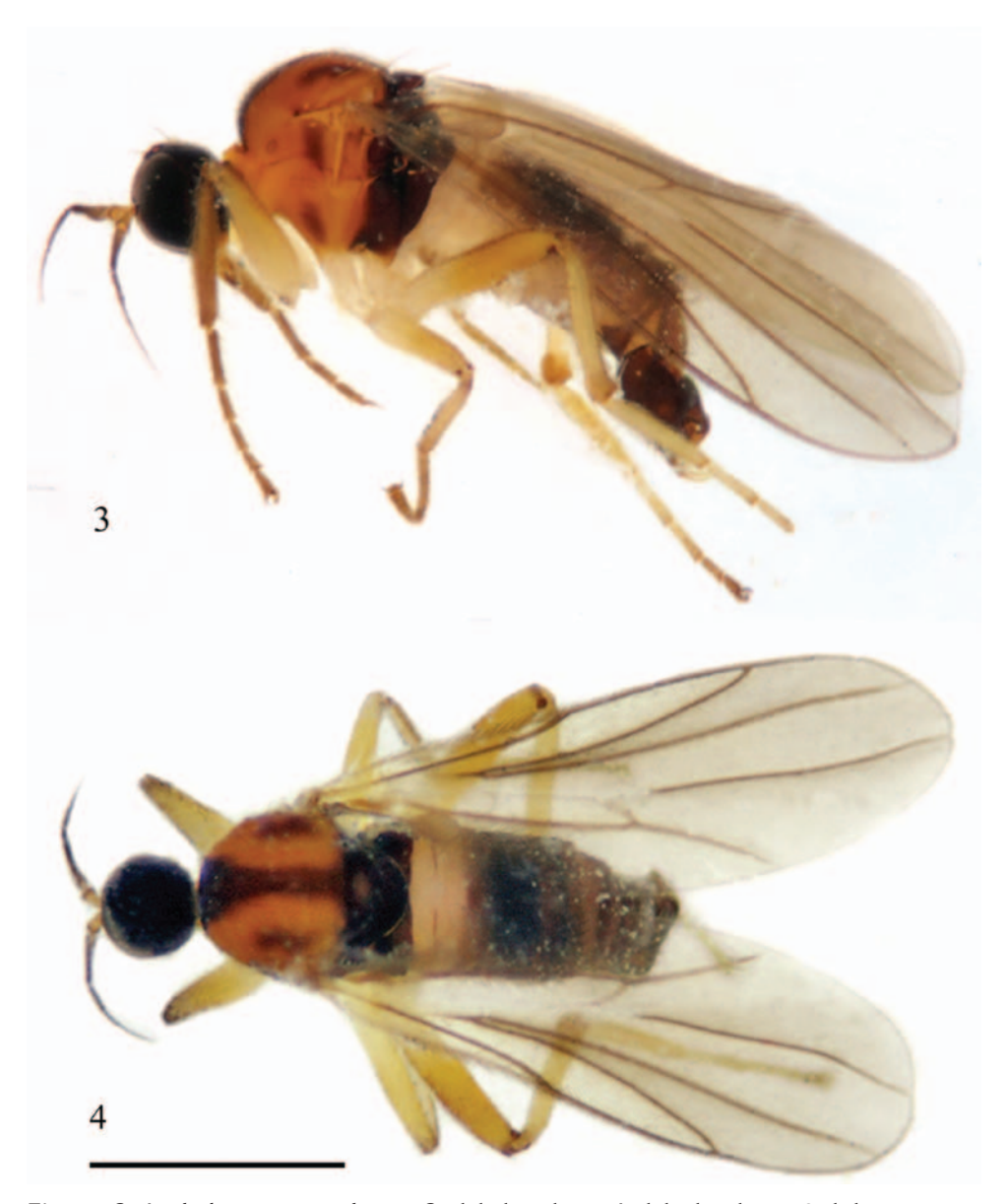
Figures 3-4. Elaphropeza trimacula sp. n. 3 adult, lateral view 4 adult, dorsal view. Scale bar 1 mm.

Abdomen dark brown with thin pale gray pollinosity; tergites complete except tergite 1 linear; tergite 3 relatively board, blackish; hypopygium blackish. Setulae and setae on abdomen blackish except tergites 3–5 each with group of short squamiform black setae laterally, tergite 7 with row of long setae at posterior margin.