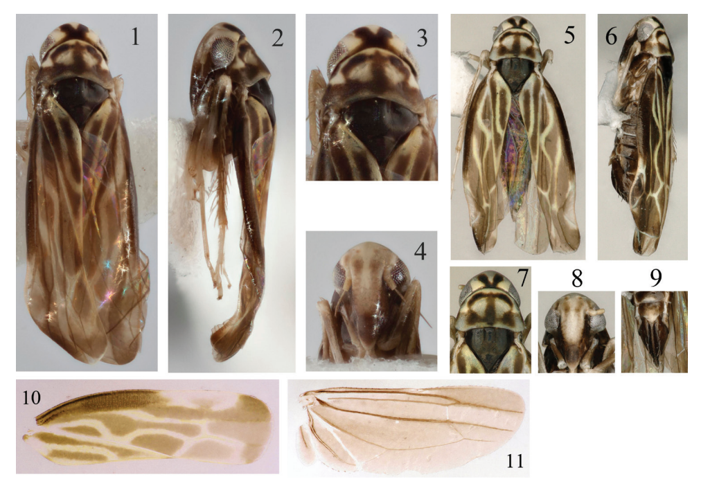
Figures I-II. Undulivena thaiensis sp. n. (♂): I habitus, dorsal view 2 habitus, lateral view 3 head and thorax, dorsal view 4 face. (♀): 5 habitus, dorsal view 6 habitus, lateral view 7 head and thorax, dorsal view 8 face 9 abdomen of female 10 forewing 11 hind wing.

4–11.ix.2008, coll. Boonnam & Phumarin (QSBG). Paratypes: 3 \circlearrowleft \circlearrowleft , 3 \hookrightarrow \hookrightarrow , same data as holotype; 4 \circlearrowleft \circlearrowleft , THAILAND, Kanchanaburi, Khuean Srinagarindra NP, Tha Thung-na/Chong Kraborg, 14^{\circ}29.972'N , 98^{\circ}53.035'E 210m, Malaise trap 6–13. xi.2008, coll. Boonnam & Phumarin (INHS, SKS).