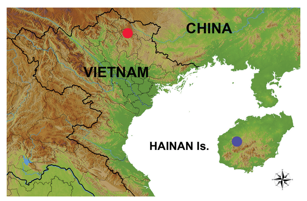
Figure 1. Distribution map of Neohylomys hainanensis . Previously known records from Hainan Island are marked with blue, new findings in Vietnam are marked with red.

anterior midback (Figure 2A). Tail bicoloured, dark above and much lighter below. Dental formula: 3.1.4.3/3.1.3.3 = 42. There are four upper and three lower premolars (Figure 2B). First upper incisor is very large. Upper canine teeth only slightly larger than adjacent incisors and premolars. The dentition of Vietnamese specimens in full concordance with that of N. hainanensis (Shaw and Wong 1959, Engesser and Jiang 2011).