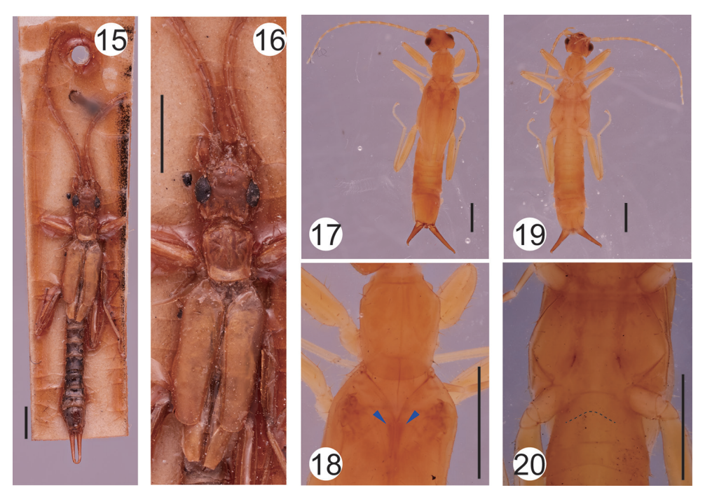
Figures 15–20. 15, 16 Mesodiplatys insularis (Borelli, 1932) (male, holotype): 15 habitus 16 head, thorax, and proximal part of abdomen. 17–20 Mesodiplatys insularis (female, paratype): 17 habitus from above 18 thorax and proximal part of tegmina 19 habitus from below 20 metasternum. Blue arrowheads in 18 indicate spiny ridges. Broken line in 20 indicates the posterior margin of the metasternum. Scale bar: 2 mm.

from a single male collected in Madagascar, as a junior synonym of D. viator . Although Hincks found a possible female specimen of this species in Burr's collection, he failed to trace the male holotype, leaving the position of this species doubtful.