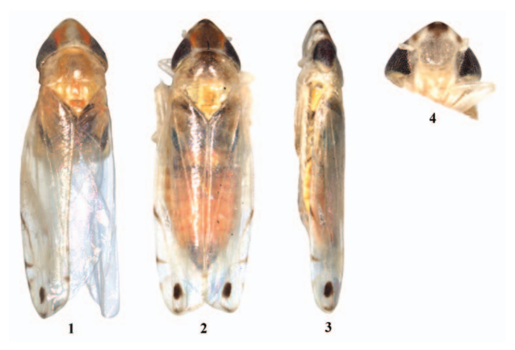
Figures I-4. I Parazyginella lingtianensis , dorsal habitus 2-4 Parazyginella tiani sp. n. 2 dorsal habitus 3 lateral habitus 4 face.

Material examined. Holotype , male, China: Guangxi Prov., Lingchuan, Lingtian, 5 June 1984, coll. Lu Xiaolin, lamp (NWAFU).