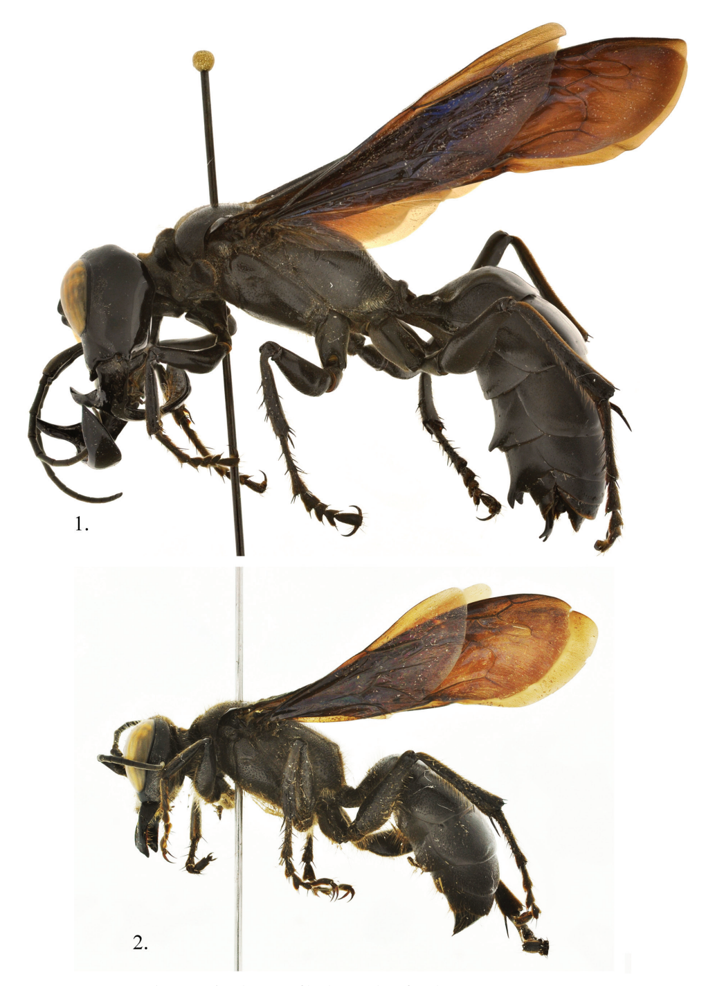
Figures I, 2. Megalara garuda side view of body I male 2 female.