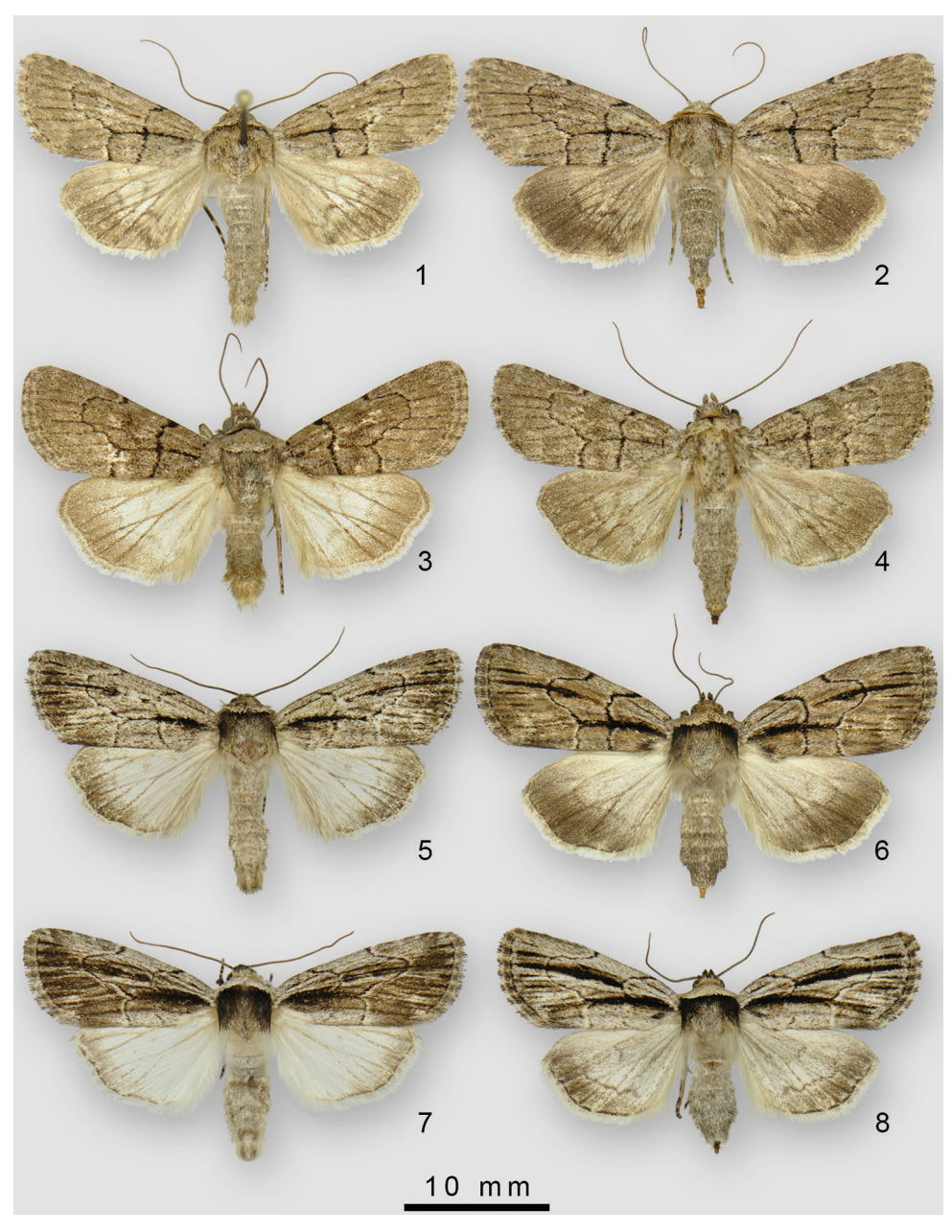
Figures 1–8. I Sympistis eleaner male (holotype) 2 S. eleaner female (paratype) 3 S. induta male 4 S. induta female 5 S. tenuistriga male 6 S. tenuistriga female 7 S. badistriga male 8 S. badistriga female.

of sclerotized portion of A8; lamella antevaginalis weakly sclerotized and unmodified; ostium forming a rounded cone, slightly longer than wide; appendix bursae pear shaped, with ductus seminalis originating at anterior end and directed caudad; corpus bursae reduced to a small, polyp-like vesicle attached to right side of main bursa chamber.