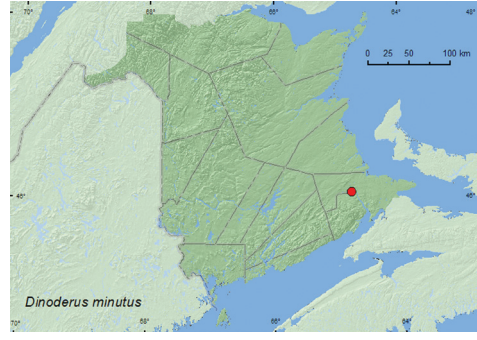
Map 4. Collection localities in New Brunswick, Canada of Dinoderus minutus .