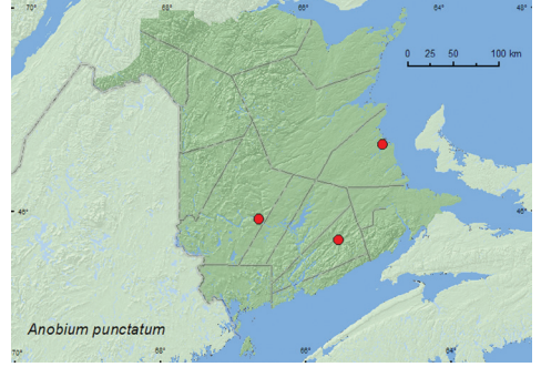
Map 6. Collection localities in New Brunswick, Canada of Anobium punctatum .

fir forest. White (1982) reported this adventive Palaearctic species from under bark of pine, hemlock, and hickory ( Carya sp.). Adults were captured during May and June in New Brunswick.