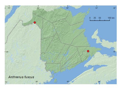
Map I. Collection localities in New Brunswick, Canada of Anthrenus fuscus