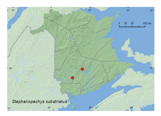
Map 5. Collection localities in New Brunswick, Canada of Stephanopachys substriatus .