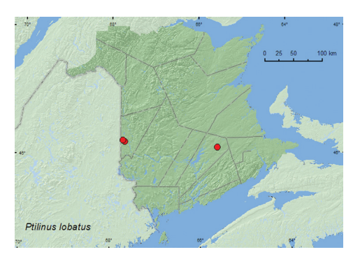
Map 9. Collection localities in New Brunswick, Canada of Ptilinus lobatus .