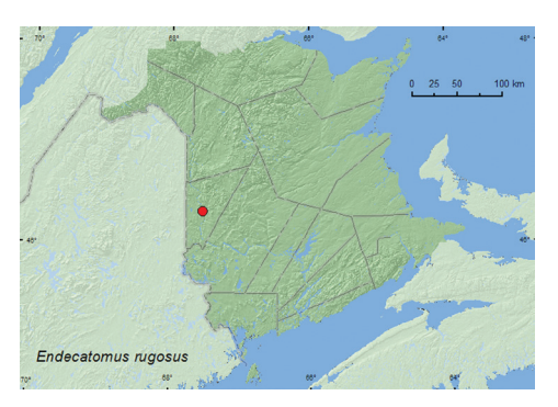
Map 3. Collection localities in New Brunswick, Canada of Endecatomus rugosus .