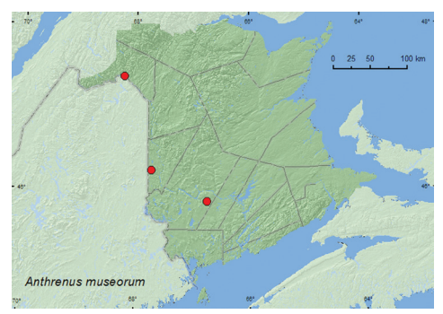
Map 2. Collection localities in New Brunswick, Canada of Anthrenus museorum .