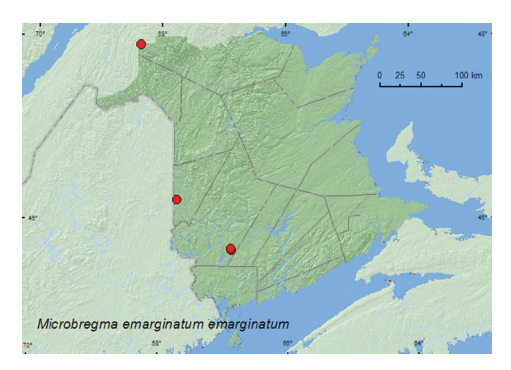
Map 7. Collection localities in New Brunswick, Canada of Microbregma emarginatum emarginatum .