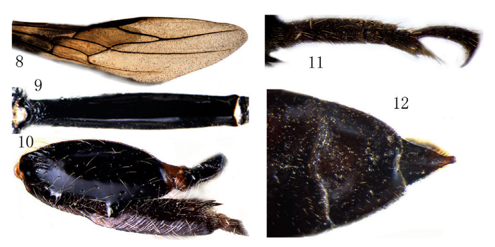
Figures 8–12. Megischus aplicatus sp. n. \circ . 8 fore wing 9 first tergite 10 hind femur and tibia 11 hind tarsus 12 pygidial process.

small foveolae; axillae foveolate and setose; scutellum (Fig. 6) medially largely smooth and laterally sparsely foveolate; mesopleuron robust, dorsal part finely setose, convex part evenly punctate and with smooth interspaces, each puncture bearing a whitish seta, metapleuron medially distinctly convex and densely foveolate-rugose, with fine setosity, ventral part largely smooth and with both dorsal anterior depression and ventral one rather deep; propodeum (Fig. 7) densely reticulate-foveolate.