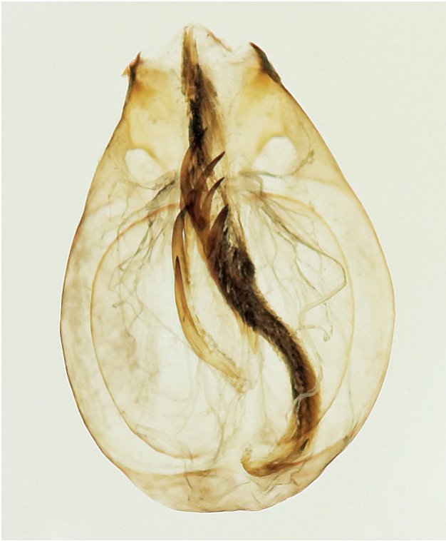
Figure 2. Aedeagus of Xantholinus elegans .

American ones are from 1930 (in Washington state) (Majka and Klimaszewski 2008a). The current distribution of X. linearis is summarized in Fig. 3.