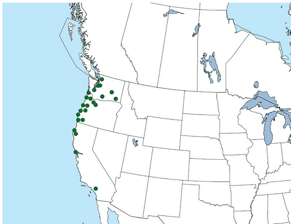
Figure 4. Distribution of X. longiventris in North America. Distribution incorporates previous records from the literature (Smetana 1982, 1988).

artefact or a shift in seasonality in response to a different geographic area. The majority of specimens have been collected in disturbed habitats and it is unknown if this species will invade habitats with little to no recent human disturbance. It is unclear whether the easternmost record (Marmora) (Fig. 1) represents an isolated population as a result of human-aided dispersal, or if it indicates an inadequately sampled, broader distribution in southern Ontario.