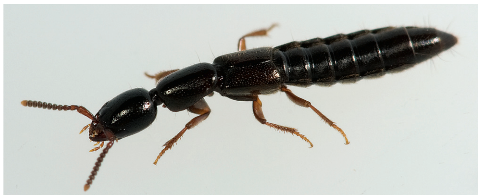
Figure 7. In vivo habitus of Xantholinus linearis , from Guelph, Ontario, Canada.