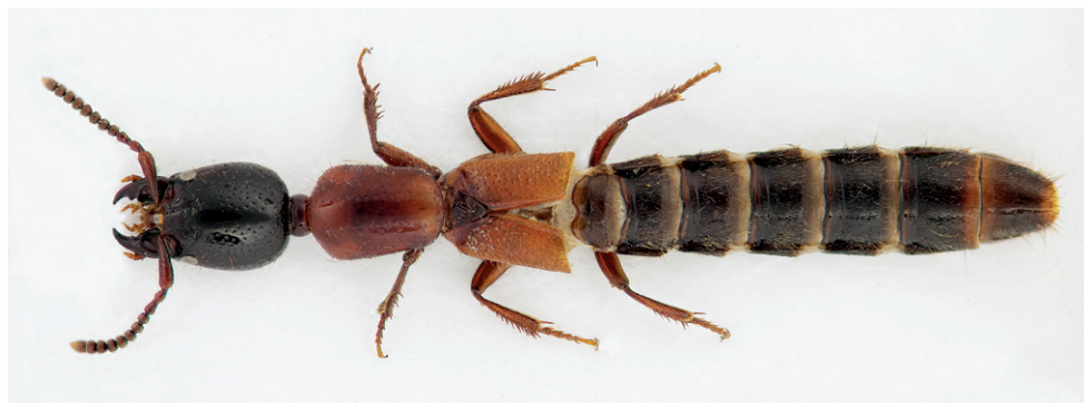
Figure 6. Dorsal habitus of Xantholinus elegans .