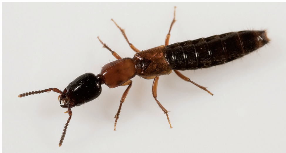
Figure 5. In vivo habitus of Xantholinus elegans , from Guelph, Ontario, Canada.