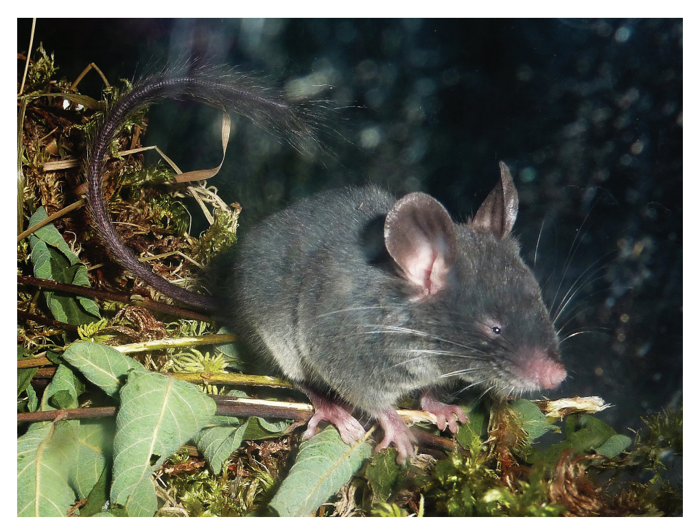
Figure 4. Typhlomys cinereus . Adult female from Sa Pa, Lao Cai Province, northern Vietnam.