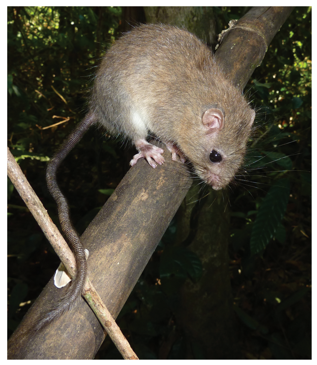
Figure 2. Hapalomys delacouri . Adult male from Bu Gia Map, Binh Phuoc Province, southern Vietnam.

The observed karyotype differs significantly from that described by Badenhorst et al. (2009) for H. delacouri from Loei, northern Thailand (see Fig. 1). The latter authors reported the karyotype as having 2n=48 and NFa=92. All the autosomes were biarmed (metacentric or submetacentric). The metacentric X and the acrocentric Y were easily recognizable because they were, respectively, the largest and the smallest elements in the karyotype. Earlier, Yong et al. (1982) described the karyotype of Hapalomys longicaudatus Blyth, 1859 based on a specimen from Malaysia. The diploid number of this