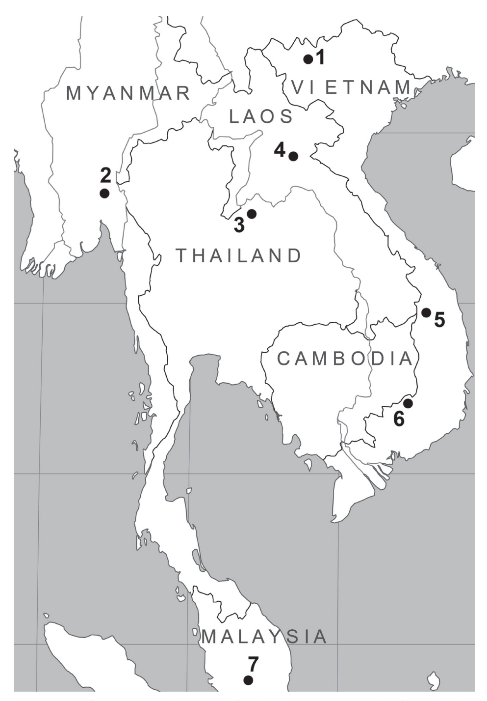
Figure 1. Map of localities. I sampling locality of Typhlomys cinereus 2 type locality of Hapalomys longi-caudatus 3 locality from Badenhorst et al. 2009 4 type locality of Hapalomys pasquieri 5 type locality of Hapalomys delacouri 6 sampling locality of Hapalomys delacouri in Bu Gia Map 7 approximate locality for Hapalomys longicaudatus record from Yong et al. 1982.