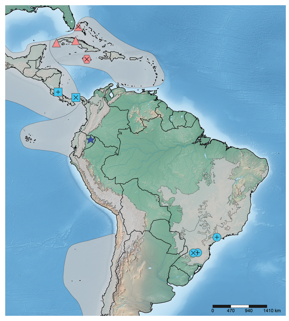
Figure 4. Distribution records for species of Zetekella and Minitingis . Blue icons = Zetekella species; square, circle, and star = Z. zeteki , Z. pulla , and Z. henryi sp. n., respectively; red icons = Minitingis records; triangle = M. minisculus and hexagon = M. elsae . Internal crosses = holotype localities; internal plus signs = new records.

be seen in all specimens of M. minusculus studied. We agree with Froeschner (1968) in regarding these two characters as reliable for distinguishing Minitingis from Zetekella . Froeschner's (1968) comments on the zoogeographical significance of the distributional records of both genera remain relevant following our description of a new species of Zetekella and report of new distribution records for Z. pulla and Z. zeteki .