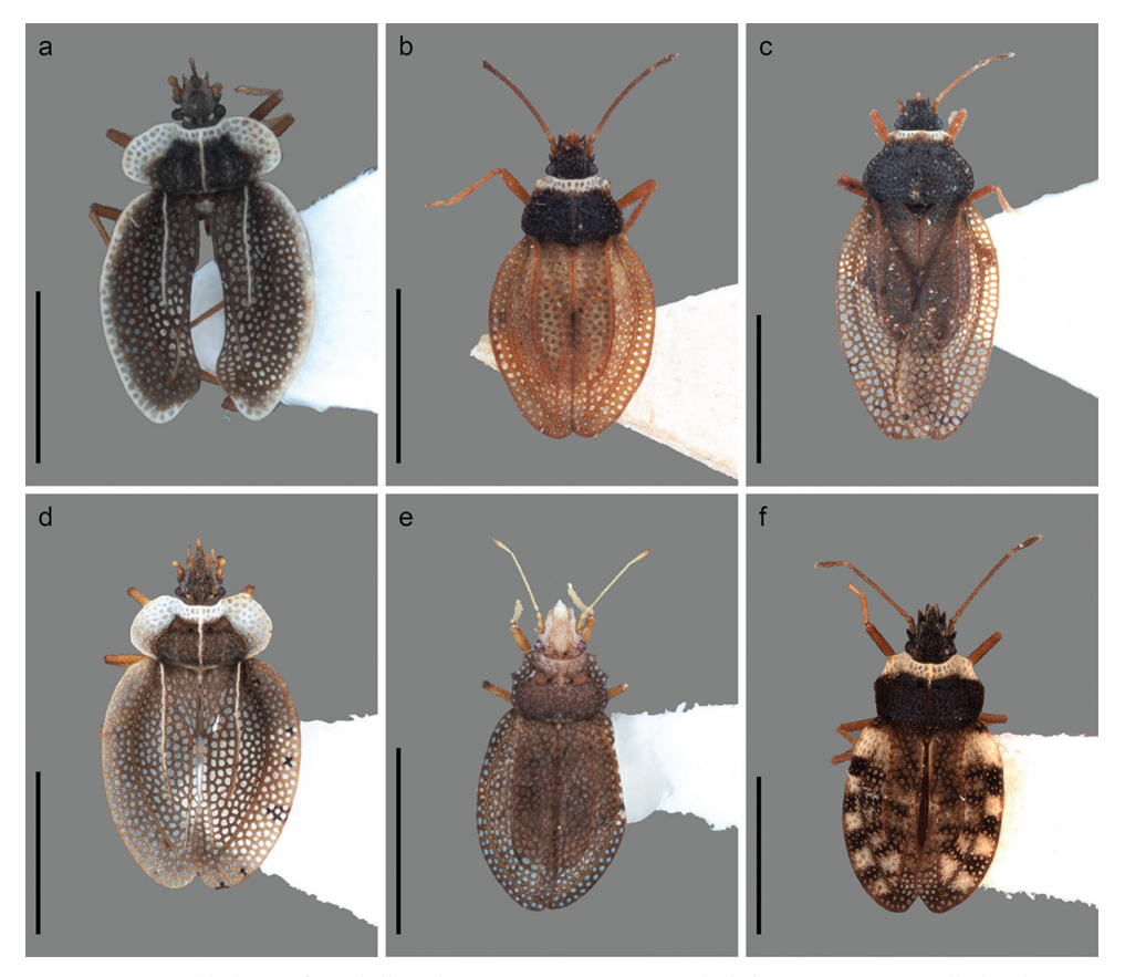
Figure I. Dorsal habitus of Zetekella and Minitingis species. a Zetekella henryi sp. n. b Z. pulla , brachypterous specimen c Z. pulla , macropterous specimen d Z. zeteki e Minitingis minusculus f Minitingis elsae . Scale bar: 1 mm.

Diagnosis. Body dark brown to blackish; cephalic spines long and thin; anterior edge of paranota not reaching the eyes; discoidal area biseriate and subcostal area irregularly quadriseriate.