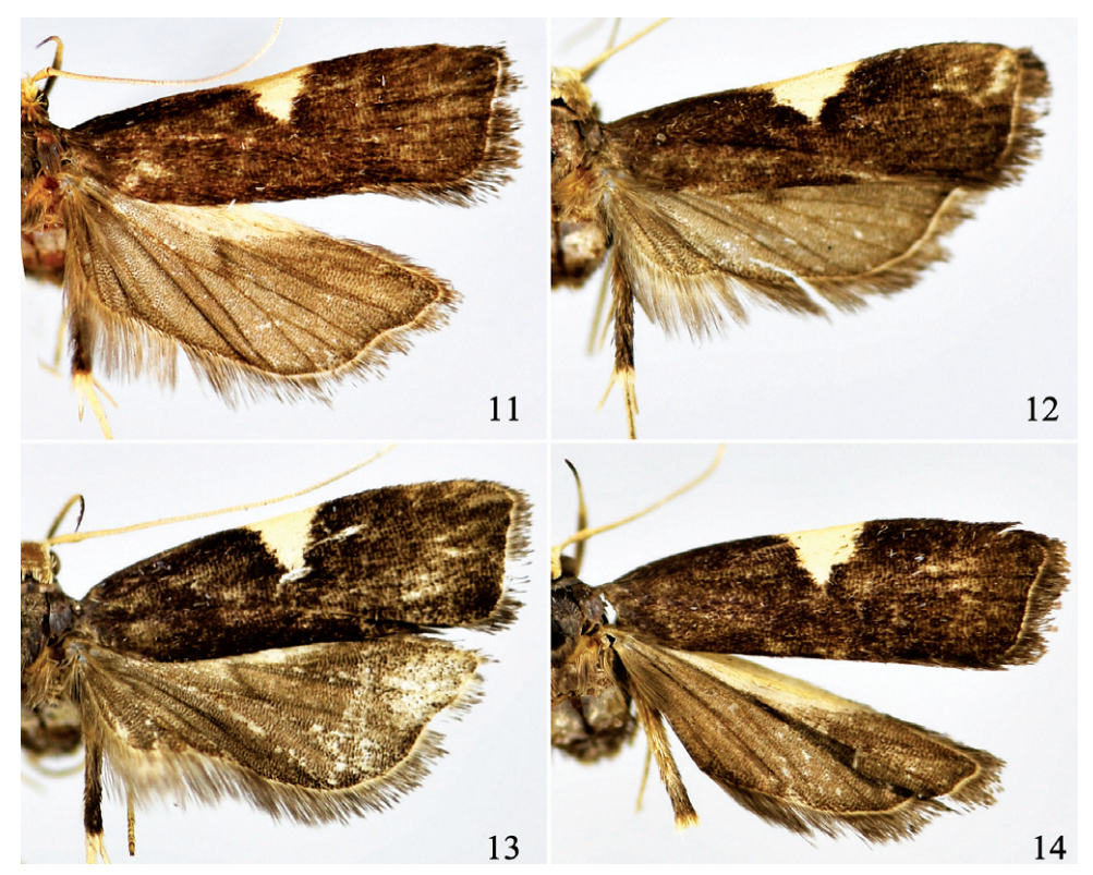
Figures 11–14. Adults of Thubana leucosphena Meyrick, showing variation of costal patch (11–12 \circlearrowleft , 13–14 \circlearrowleft ).

Discussion. This species was described by Meyrick (1931) based on three specimens collected from Guanxian of Sichuan Province in China: "two males" and "a third example". Clarke (1965) rectified the "two males" as Oecophoridae and chose the "third example", a female, as the lectotype of T. leucosphena. Meyrick (1935) mentioned the occurrence of this species in Tianmushan of Zhejiang Province. Gozmány (1978) described T. microcera on the basis of a male specimen collected from Tianmushan and noticed that it could be distinguished from T. leucosphena by the shape of the costal patch. In this study, however, we noticed that the costal patch varies from triangular to trapezoidal both within male specimens of T. microcera (Figs 11–12) and female specimens of T. leucosphena (Figs 13–14). We also found that males collected from Zhejiang, Jiangxi, Hubei and Henan provinces match with those of T. microcera described by Gozmány, females match with those of T. leucosphena. Besides, we observed the deciduous spicules from the male aedeagus in the ductus bursae of T. leucosphena . What is more, no other species of Thubana were collected in these localities so far. Hence, we treat T. microcera as a junior synonym of T. leucosphena, and regard the variation of the shape of costal patch from triangular to trapezoidal as intraspecific variation.