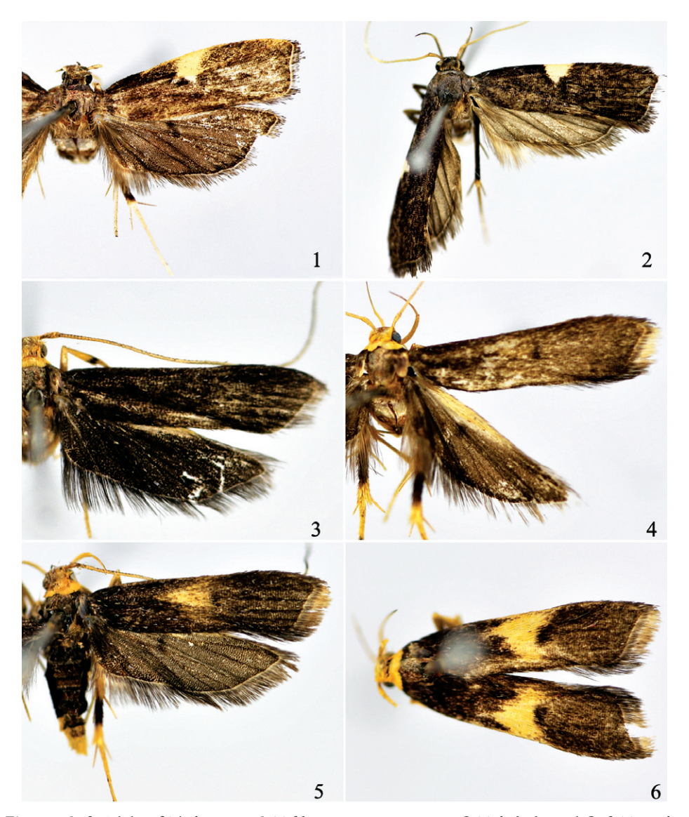
Figures 1–6. Adults of Thubana spp. 1 T. felinaurita sp. n., paratype 2 T. dialeukos Park 3–6 T. xanthoteles (Meyrick), showing variation of costal patch (1-4 \, \circlearrowleft, \, 5-6 \, \circlearrowleft) .