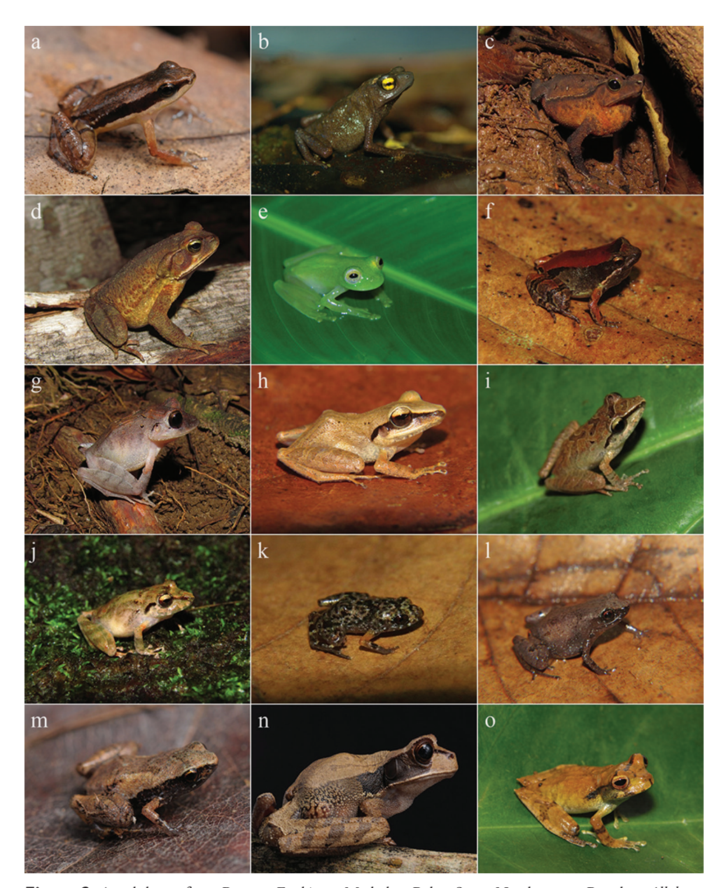
Figure 2. Amphibians from Reserva Ecológica Michelin, Bahia State, Northeastern Brazil. a Allobates olfersioides b Frostius erythrophthalmus c Rhinella hoogmoedi d Rhinella crucifer e Vitreorana eurygnatha f "Eleutherodactylus" bilineatus g Haddadus binotatus h Pristimantis paulodutrai i Pristimantis sp. j Pristimantis vinhai k Adelophryne cf. pachydactyla l Adelophryne mucronatus m Adelophryne sp. n Gastrotheca recava o Gastrotheca sp.