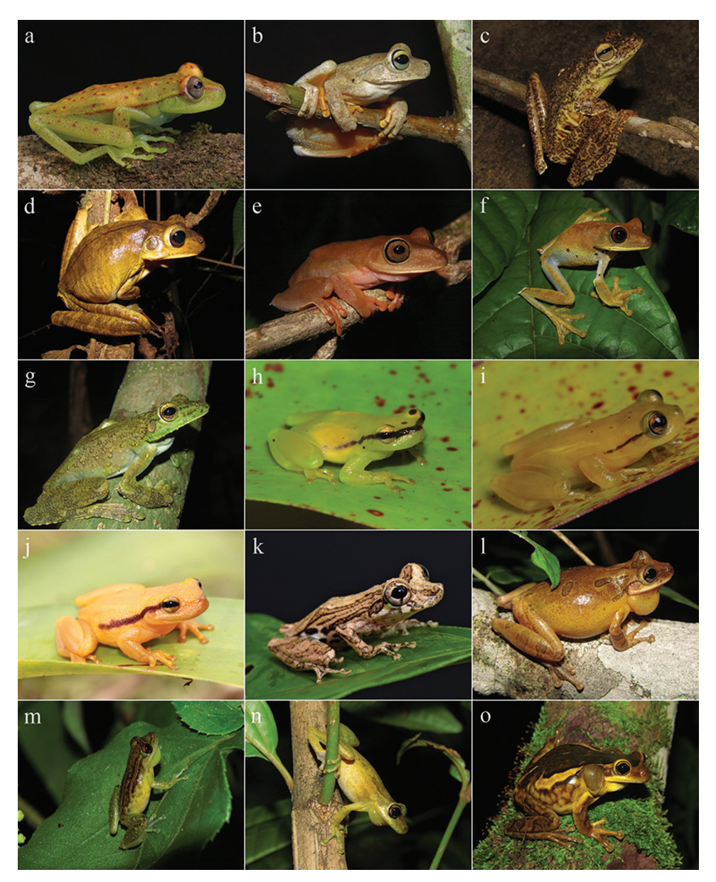
Figure 4. Amphibians from Reserva Ecológica Michelin, Bahia State, Northeastern Brazil. a Boana atlantica b Boana crepitans c Boana exastis d Boana faber e Boana pombali f Boana semilineata g Itapotihyla langsdorffii h Phyllodytes melanomystax i Phyllodytes praeceptor j Phyllodytes sp. k Ololygon strigilata l Scinax eurydice m Scinax juncae n Scinax x-signatus o Trachycephalus mesophaeus.