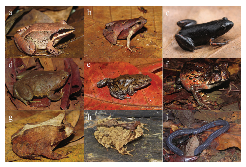
Figure 6. Amphibians from Reserva Ecológica Michelin, Bahia State, Northeastern Brazil. a Leptodac tylus mystaceus b Physalaemus camacan c Chiasmocleis cordeiroi d Stereocyclops incrassatus e Dermatonotus muelleri f Macrogenioglottus alipioi g Proceratophrys renalis h Proceratophrys schirchi i Siphonops annulatus.

et al. in prep ). Vitreorana sp. was recorded by Camurugi et al. (2010) only in larval form, but adult males were collected and, using morphological and bio-acoustic traits, are identified as Vitreorana eurygnatha . Scinax aff. alter and Chiasmocleis sp. are re-classified as Scinax juncae and Chiasmocleis crucis , respectively. Phyllodytes luteolus as Phyllodytes praeceptor (Orrico et al. 2018). The species formerly classified as Dendropsophus senicu lus , Physalaemus signifer and Leptodactylus marmoratus , are now classified as Dendropso phus novaisi , Physalaemus camacan and Adenomera thomei , respectively.