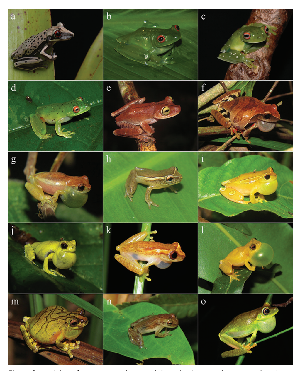
Figure 3. Amphibians from Reserva Ecológica Michelin, Bahia State, Northeastern Brazil. a Aparasphenodon brunoi b Aplastodiscus cavicola c Aplastodiscus ibirapitanga d Aplastodiscus sibilatus e Bokermannohyla capra f Dendropsophus anceps g Dendropsophus branneri h Dendropsophus decipiens i Dendropsophus elegans j Dendropsophus giesleri k Dendropsophus haddadi l Dendropsophus minutus m Dendropsophus novaisi n Dendropsophus aff. oliveirai o Boana albomarginata.