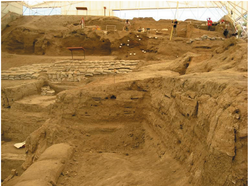
Figure 5. The edge of a house wall where the freshwater and the terrestrial gastropods were collected from the excavation area in Catalhöyük archaeological site (Bar-Yosef Mayer and Gümüş 2008).

Next to these human-related fields, the taxonomic composition of these findings can be used as indicators for the prevailing climatic conditions at the time when these