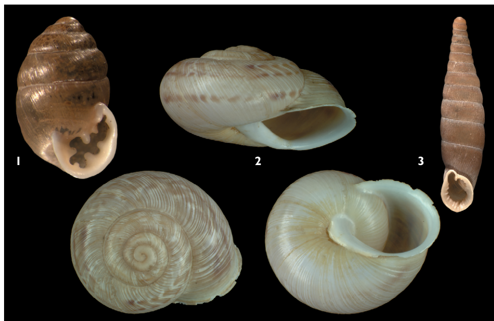
Figures 1–3. Endemic molluscan species from Turkey described by G. A. Olivier: 1 Multidentula ovularis (Olivier, 1801), 20 km S of Küthaya, ex coll. Menkhorst, H = 5.1 mm 2 Assyriella guttata (Olivier, 1804), syntype MNHN (coll. Olivier), Urfa, D = 32.3 mm 3 Bulgarica denticulata (Olivier, 1801), syntype MNHN (coll. Olivier), “Ghemlek”, H = 14.7 mm.

numbers since 1950 is presented in Table 1. It illustrates the enormous increase of taxonomical knowledge which was achieved during this relatively short period.