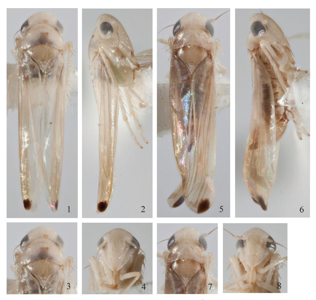
Figures 1–8. Gladkara klongensis Song & Dietrich, sp. n. Male ( \mathcal{J} ): 1 Habitus, dorsal view 2 Habitus, lateral view 3 Head and thorax, dorsal view 4 Face; Female ( \mathcal{Q} ): 5 Habitus, dorsal view 6 Habitus, lateral view 7 Head and thorax, dorsal view 8 Face.