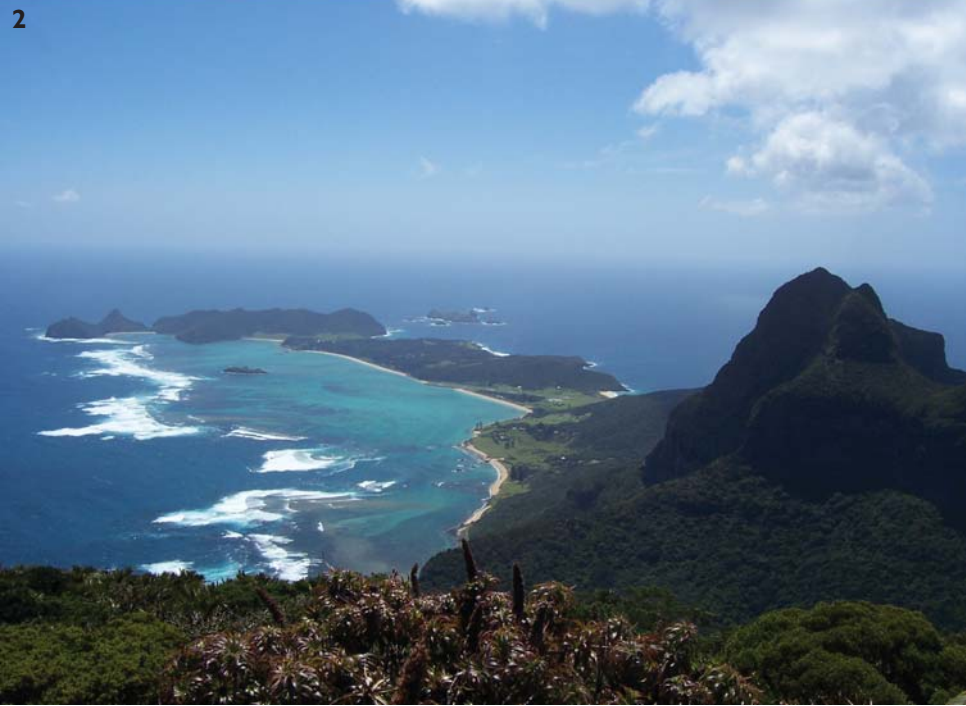
Figures 1–2. Lord Howe Island. I view south from Kim's Lookout showing Mount Lidgbird (left) and Mt Gower (right) 2 view north from summit of Mt Gower.