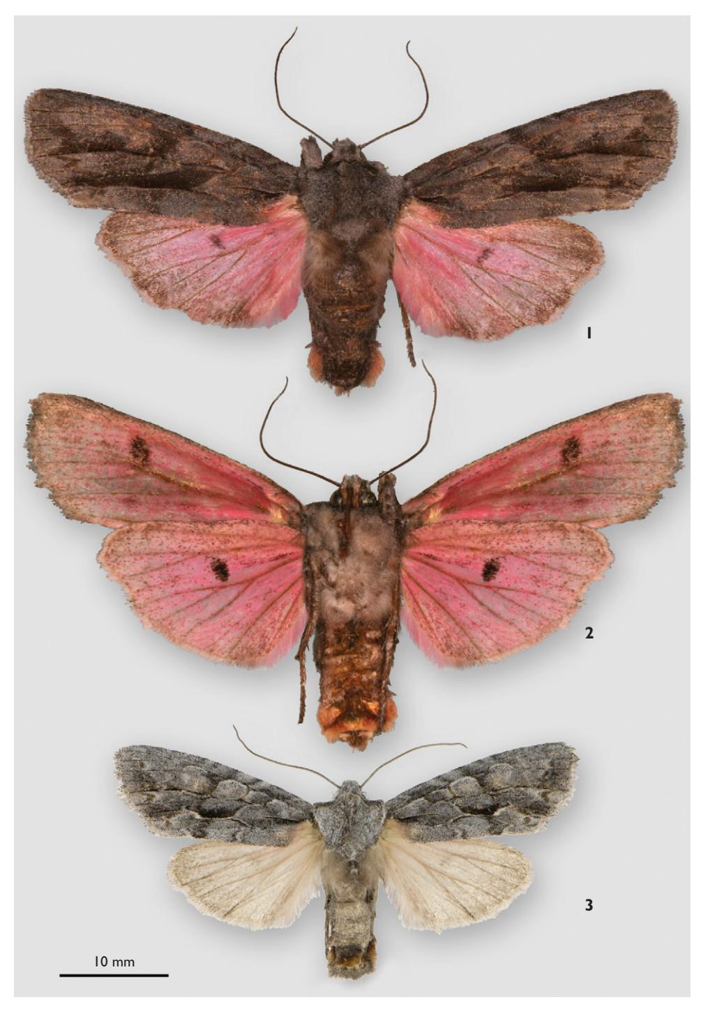
Figures 1-3. Adults of Lithophane species. 1, 2. L. leeae Walsh, holotype. USA, Arizona, Cochise County, Chiricahua Mountains, Onion Saddle, 7700', 14 June 2007. 3. L. atara (Smith), Canada, B. C., Summerland, 18 November 1994.